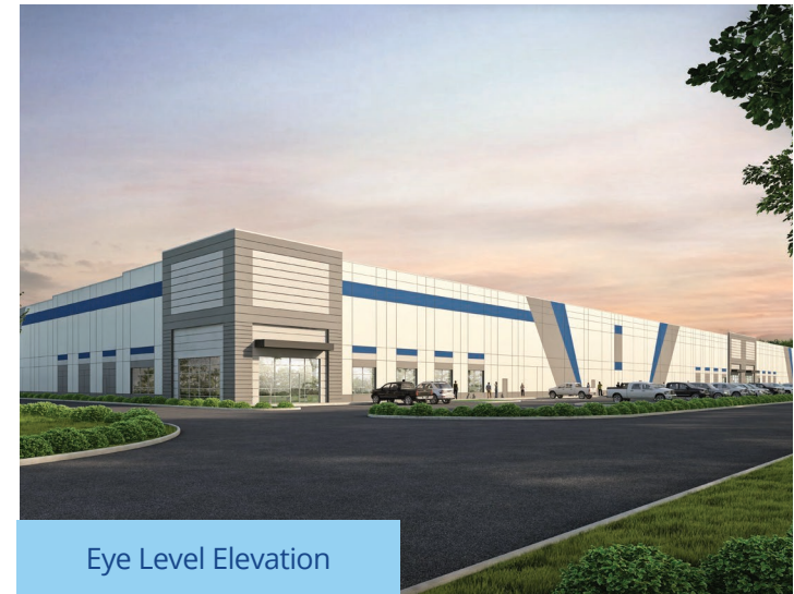
Eye Level Elevation