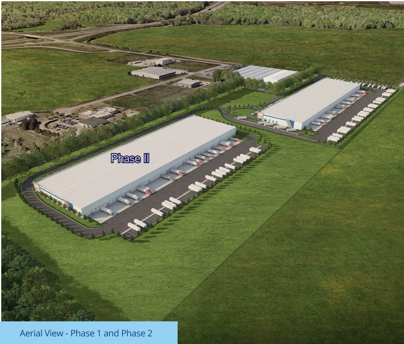
Aerial View - Phase 1 and Phase 2