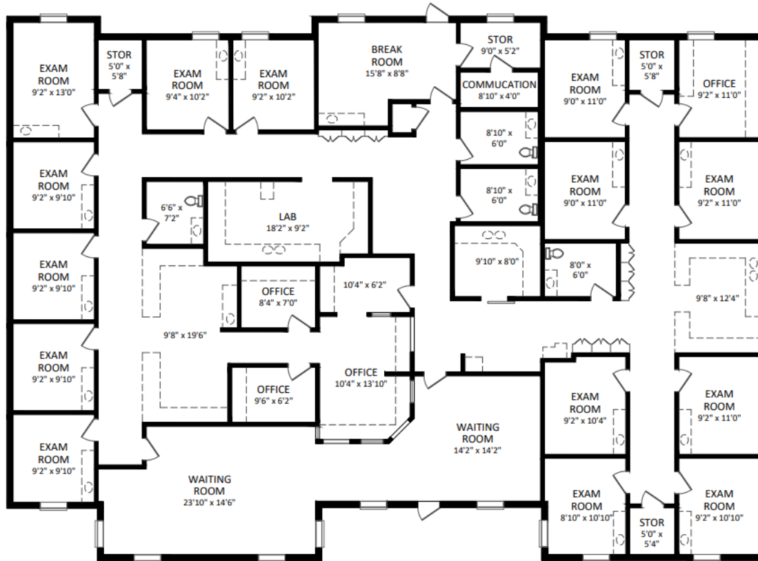
10220 PROSPERITY PARK DR SUITE 300