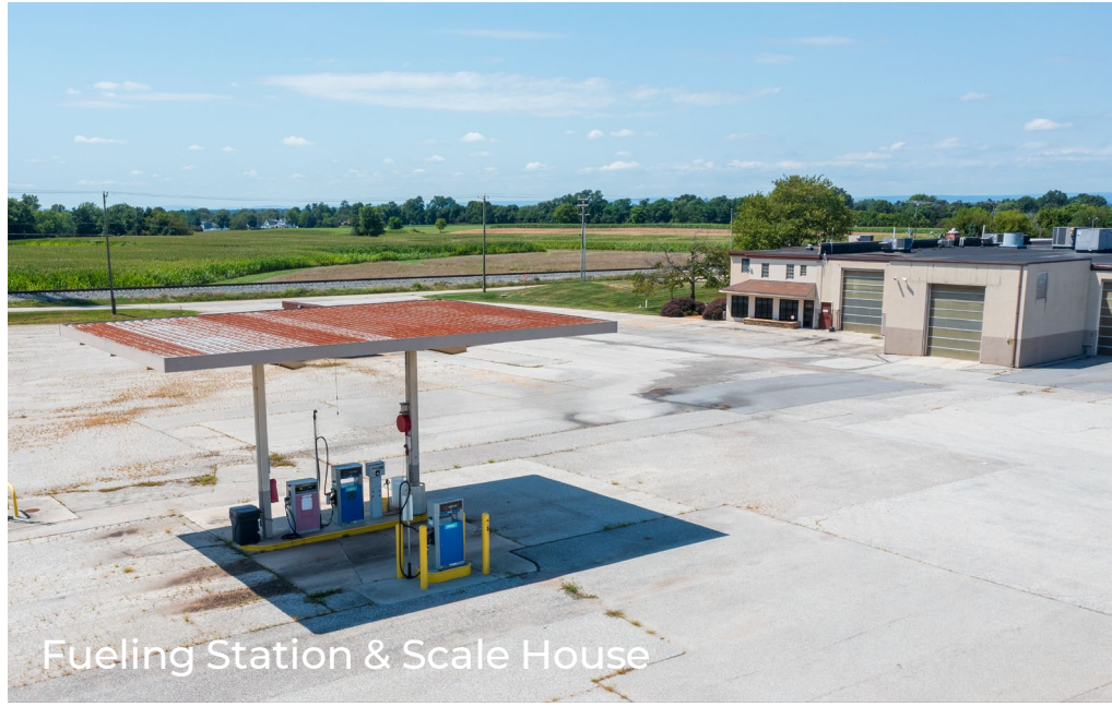
Fueling Station & Scale House