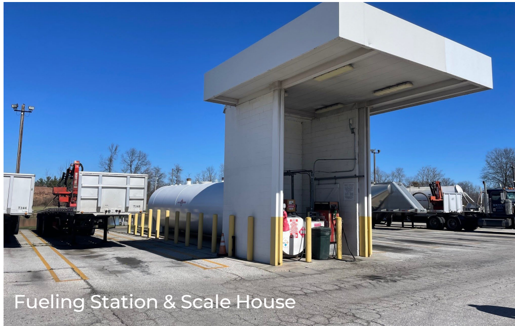
Fueling Station & Scale House