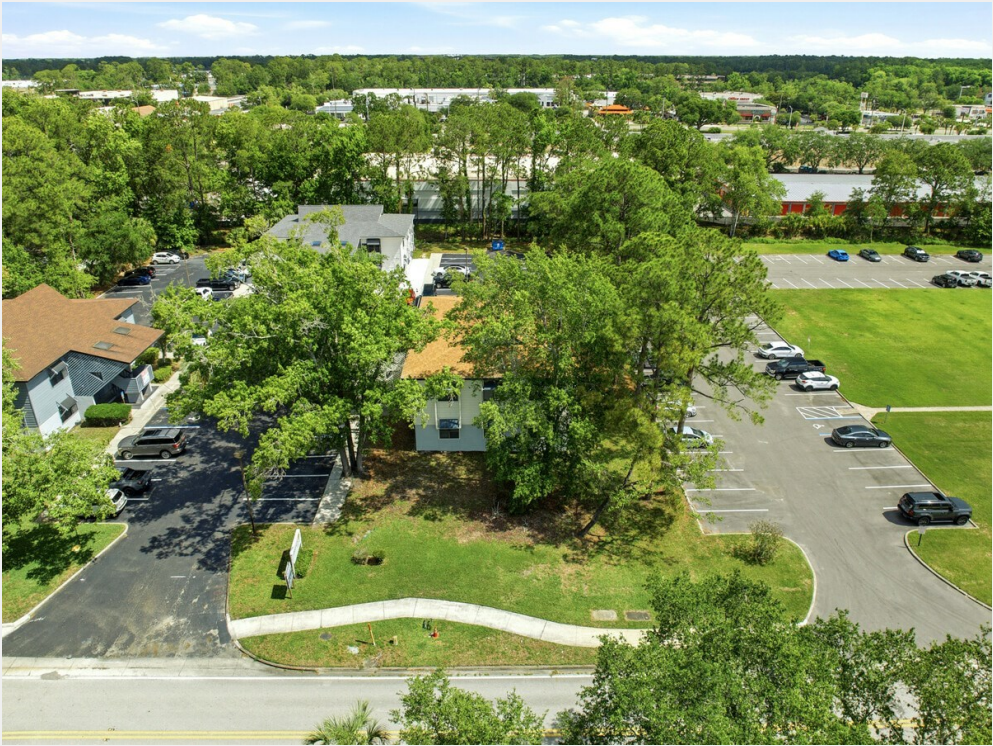
drone - 7