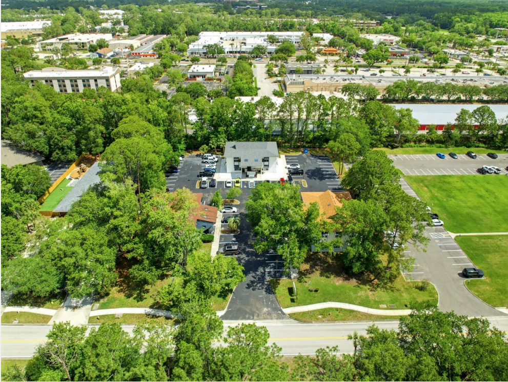
drone - 12