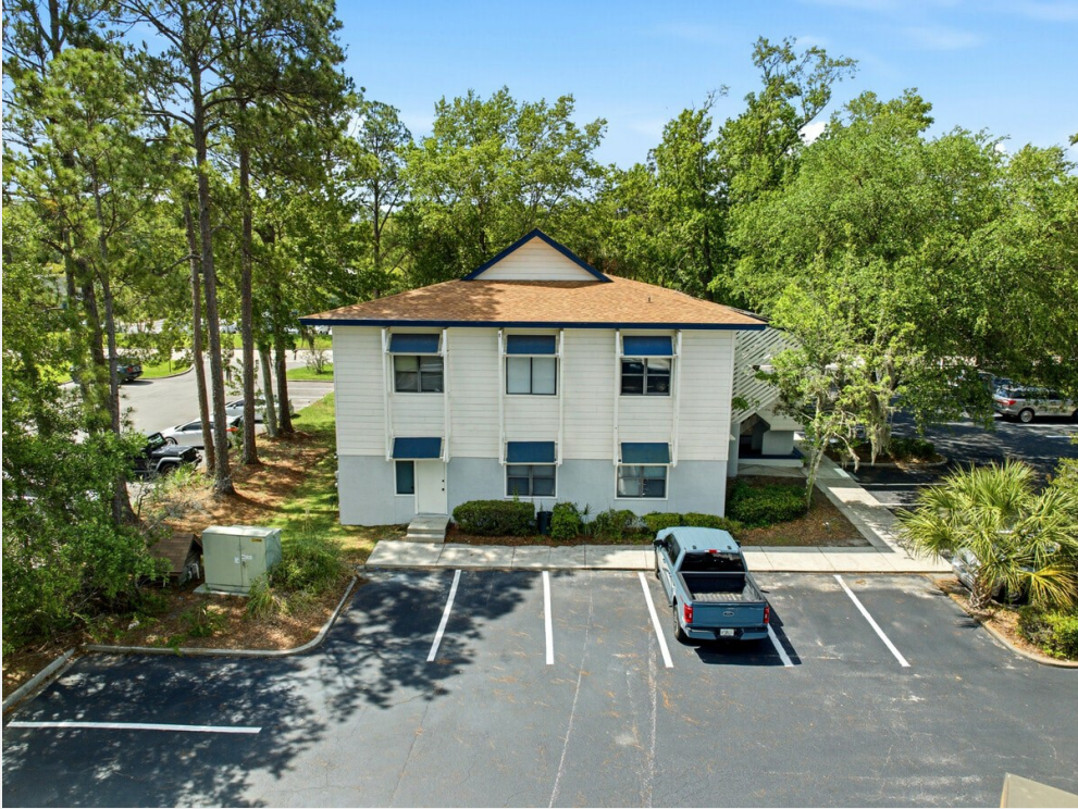
drone - 3