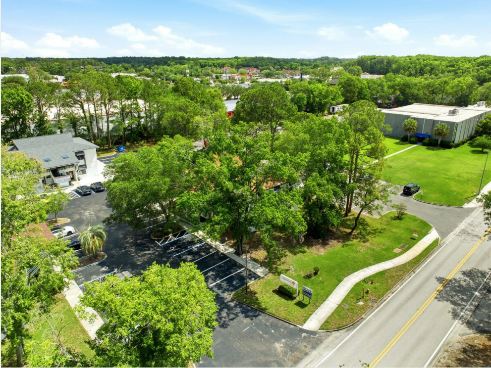
drone - 6