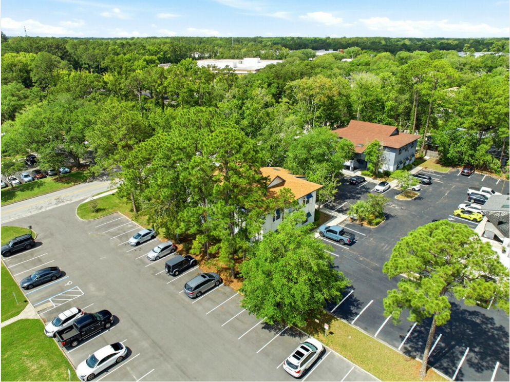
drone - 10