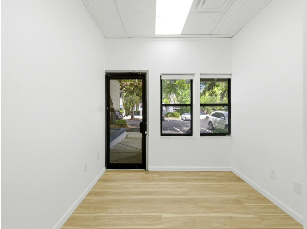
14 - interior