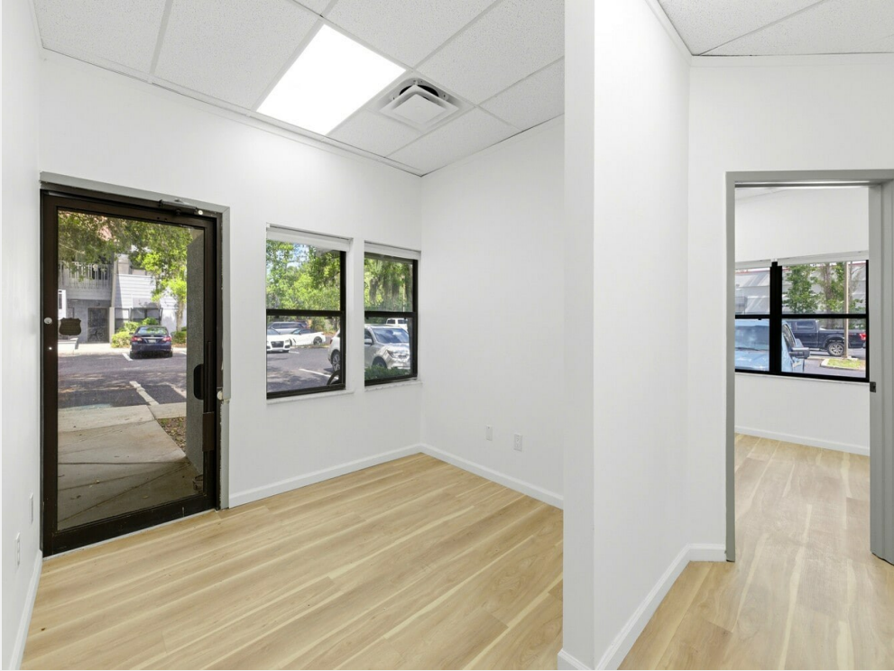
16 - interior