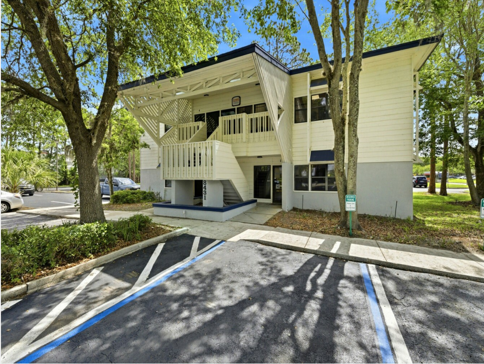
1 - exterior