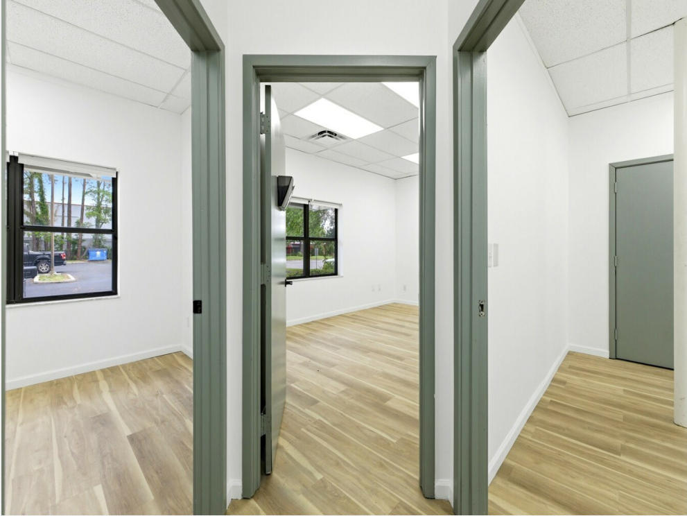
17 - interior