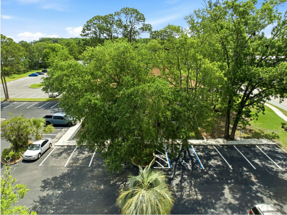
drone - 5