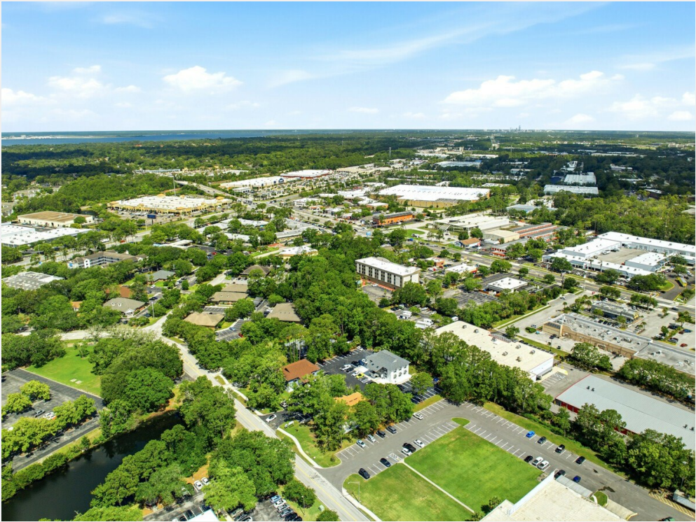
drone - 25