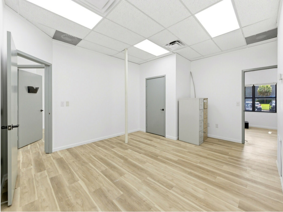
26 - interior