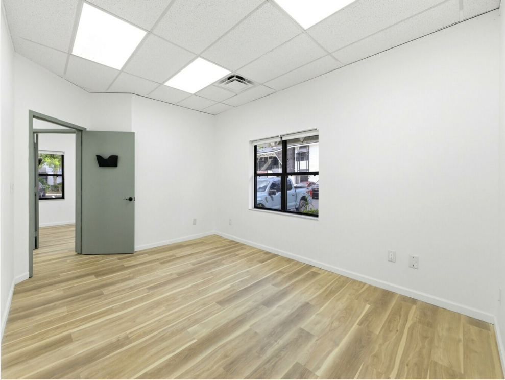
23 - interior