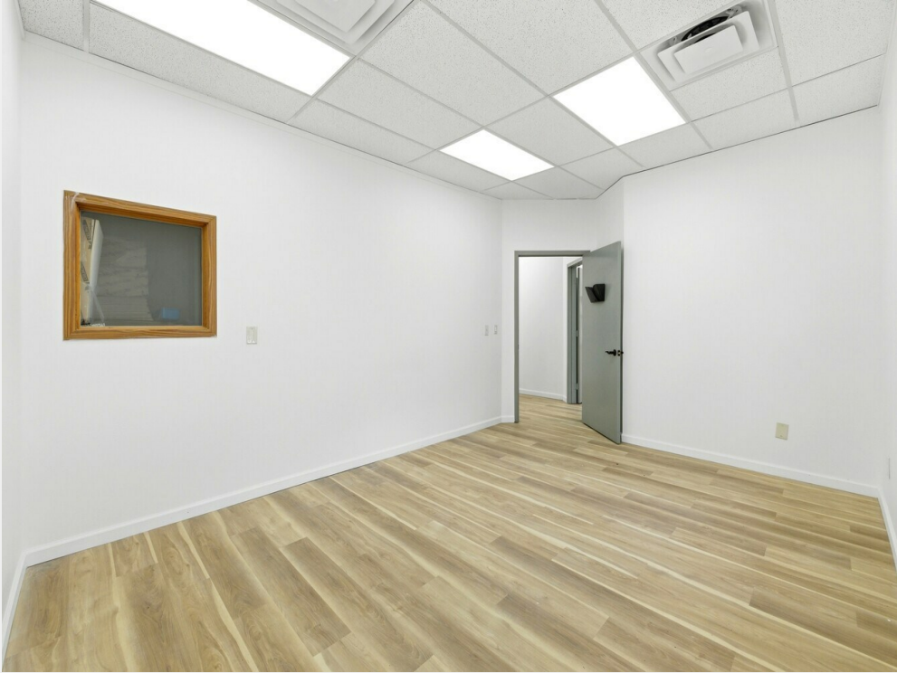
24 - interior