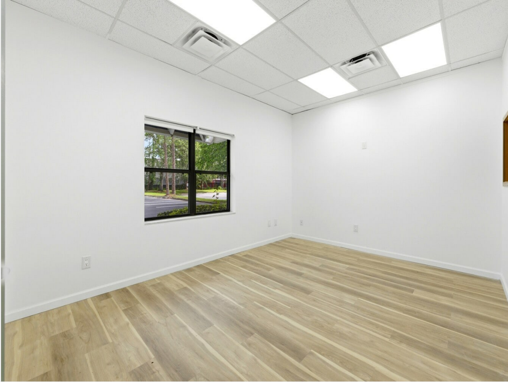
22 - interior