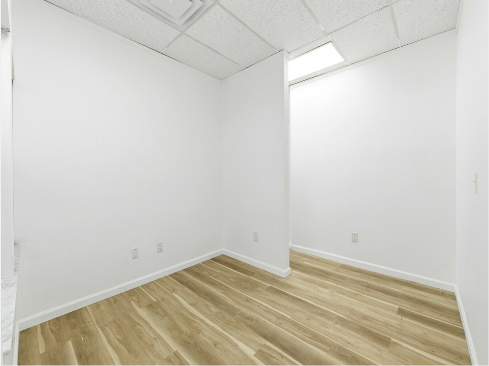
33 - interior