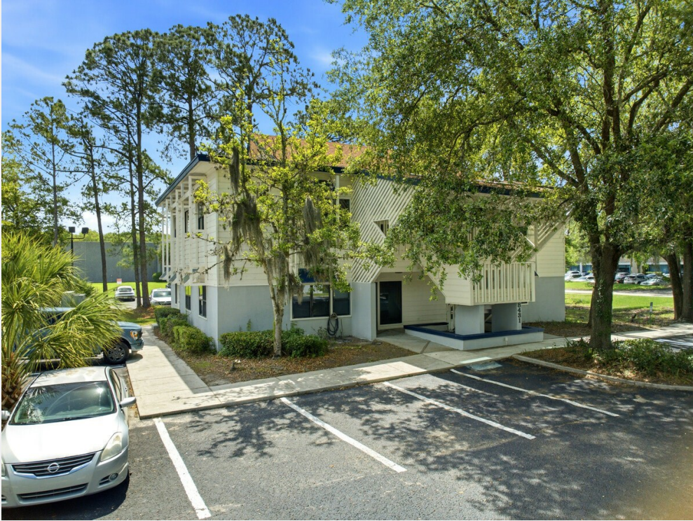
drone - 1