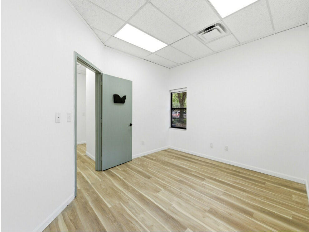
19 - interior