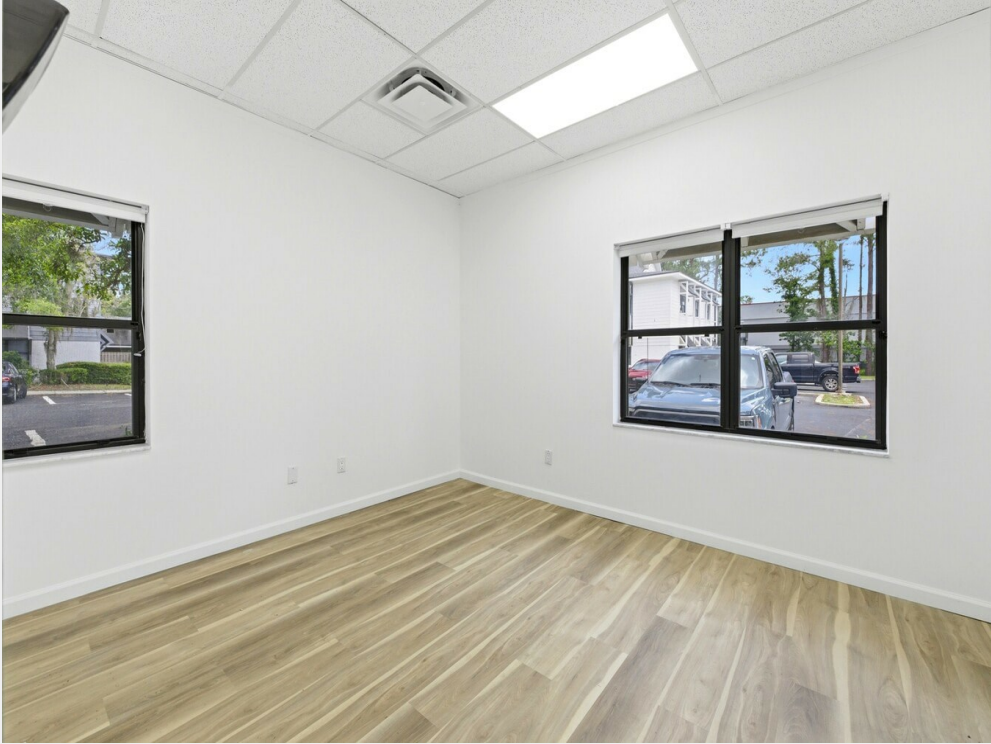
18 - interior