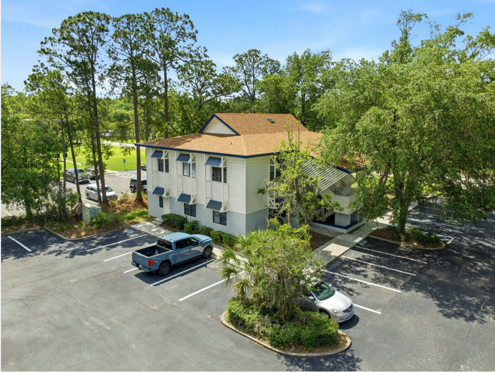
drone - 4