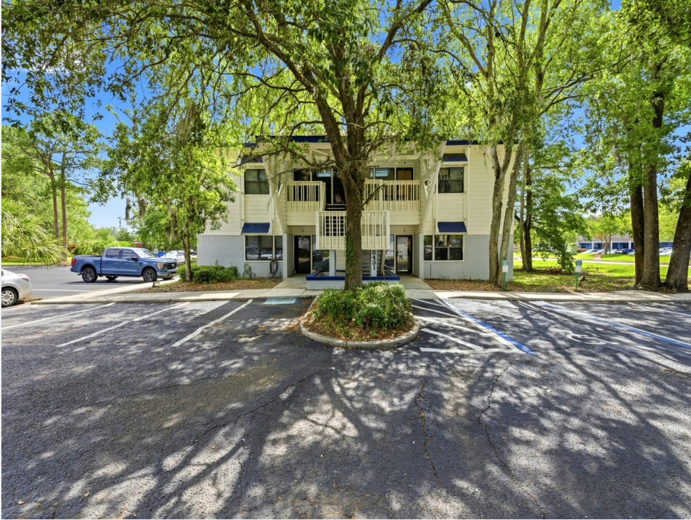
3 - exterior