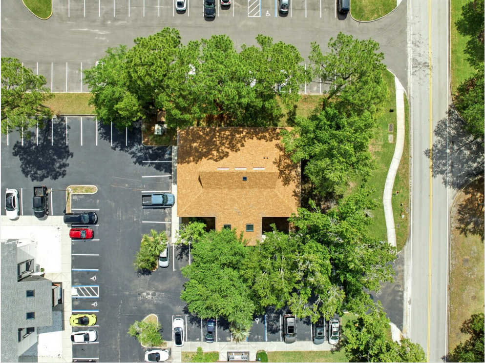
drone - 11