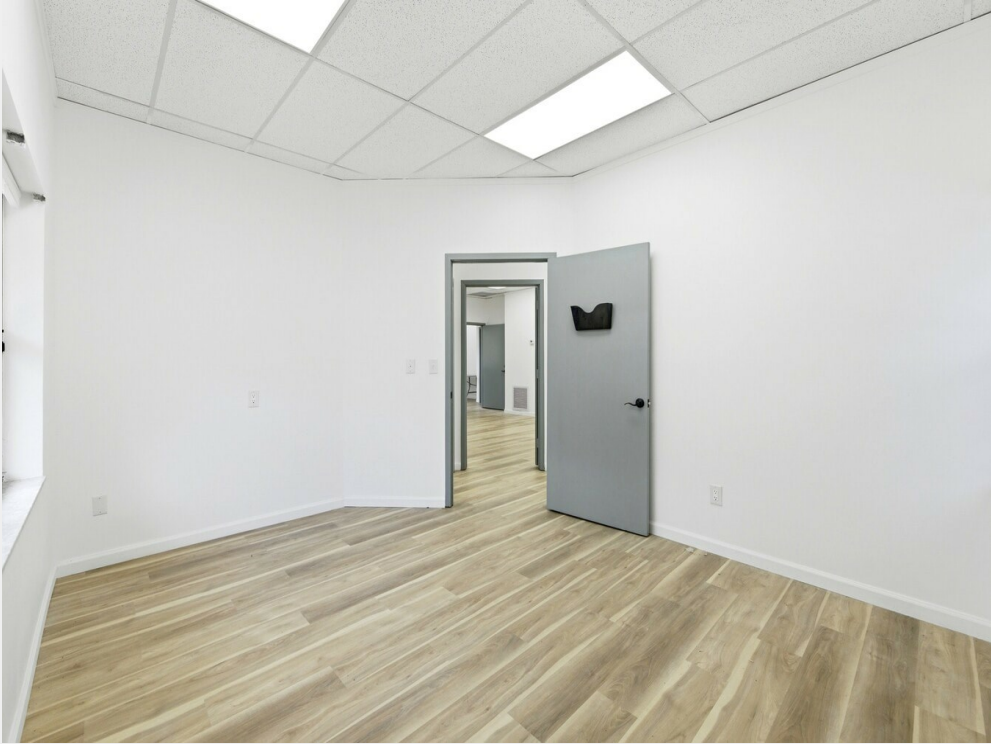
20 - interior