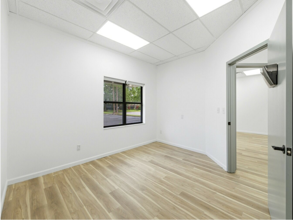
21 - interior