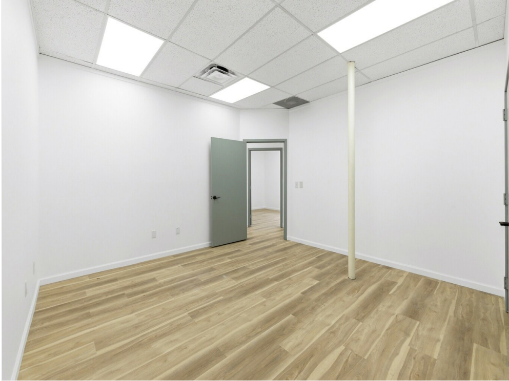
27 - interior