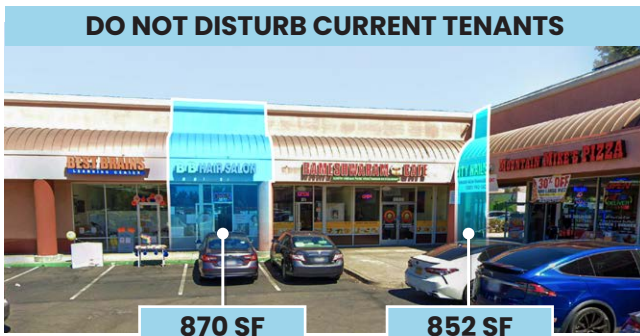
DO NOT DISTURB CURRENT TENANTS