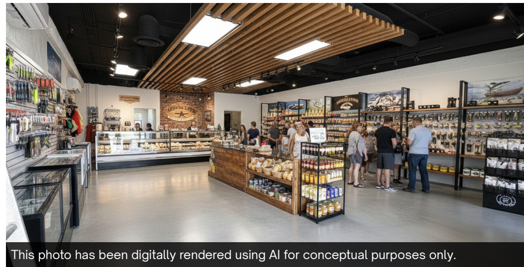
This photo has been digitally rendered using AI for conceptual purposes only.