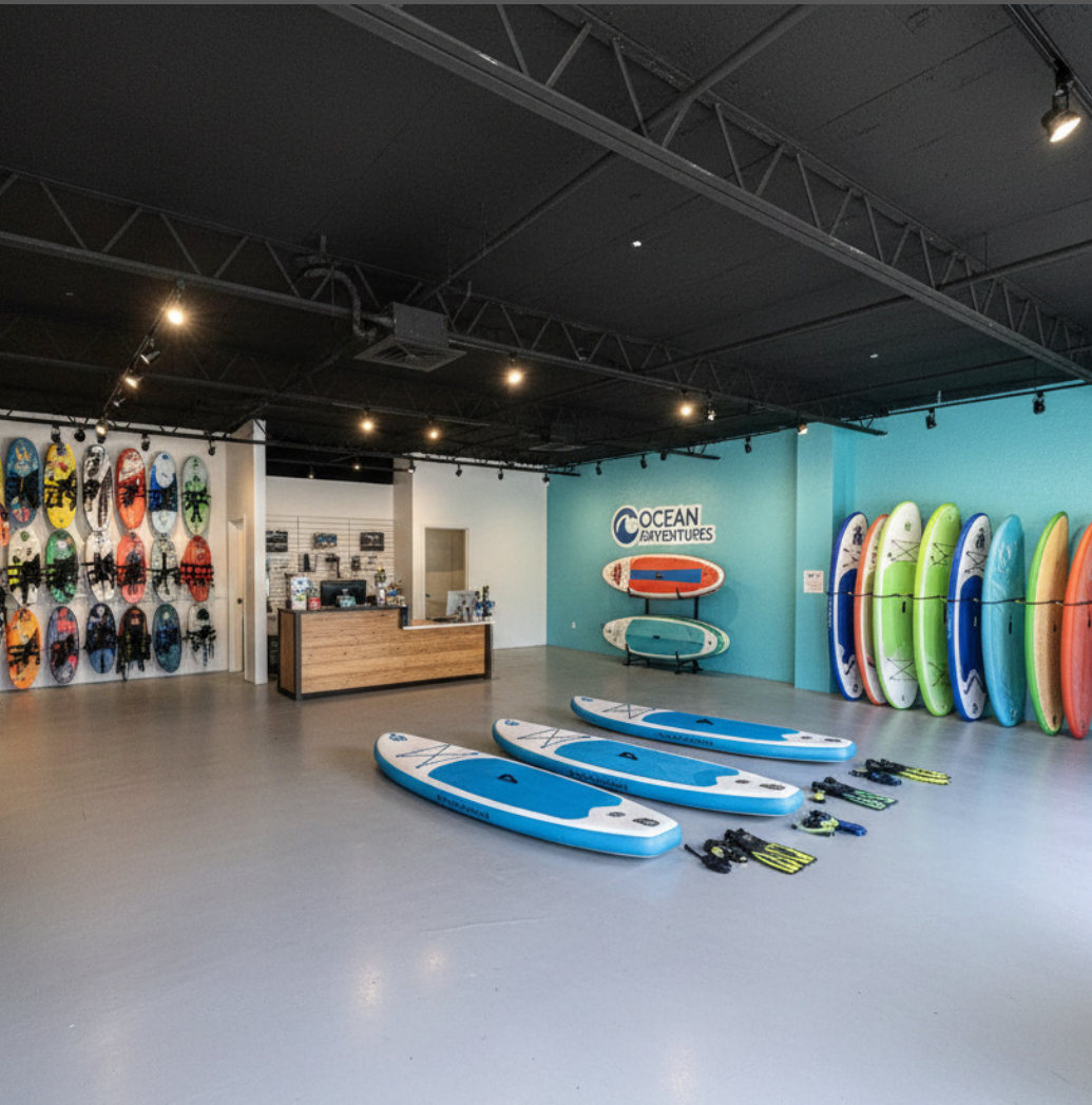
This photo has been digitally rendered using AI for conceptual purposes only.