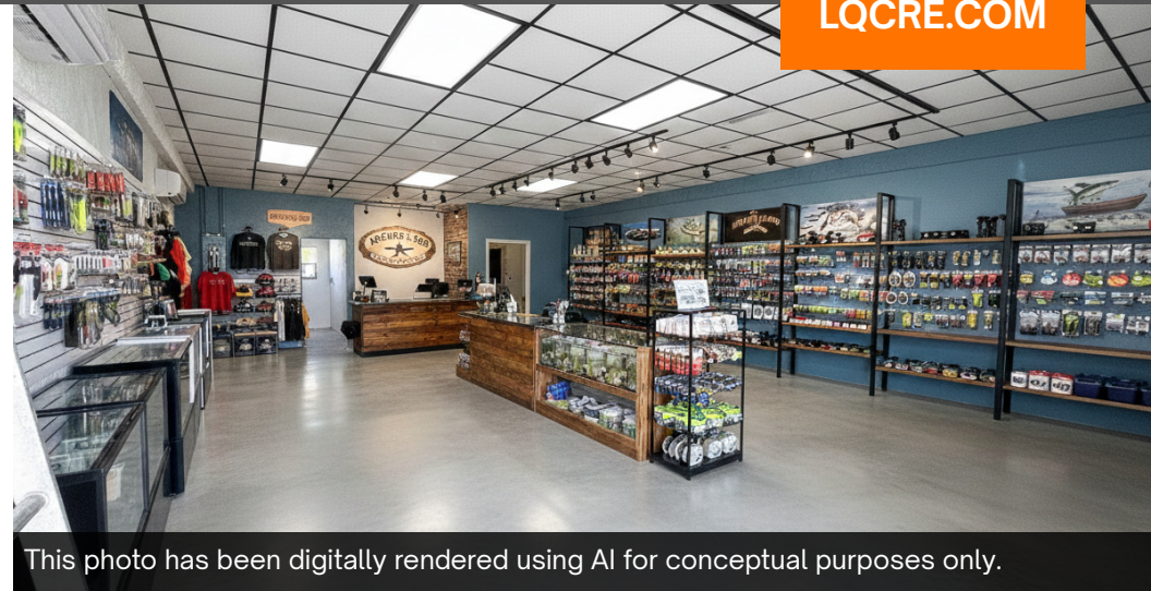
This photo has been digitally rendered using AI for conceptual purposes only.