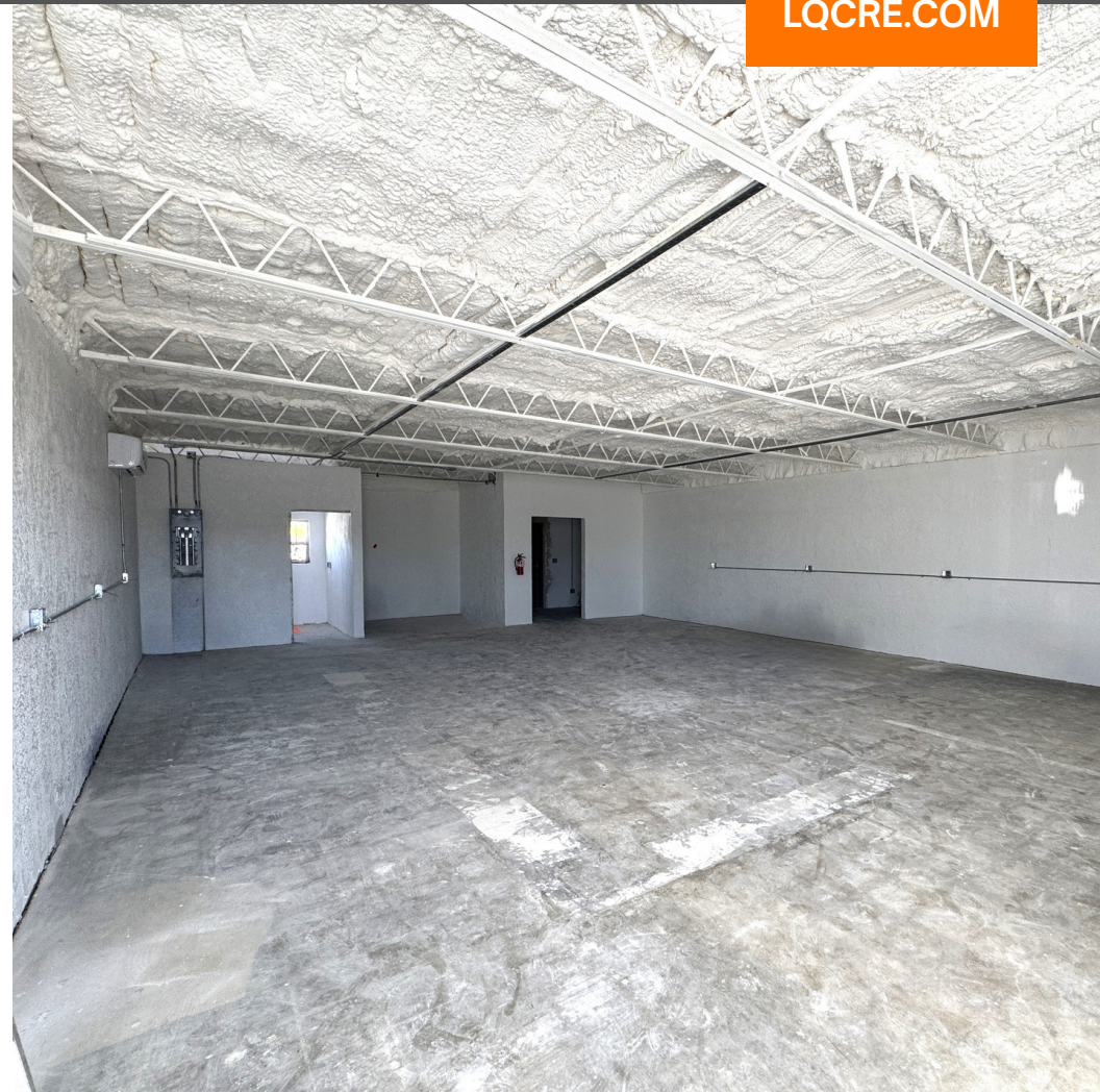
Current Condition of Unit