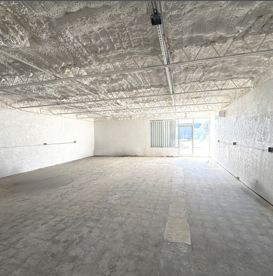
Current Condition of Unit