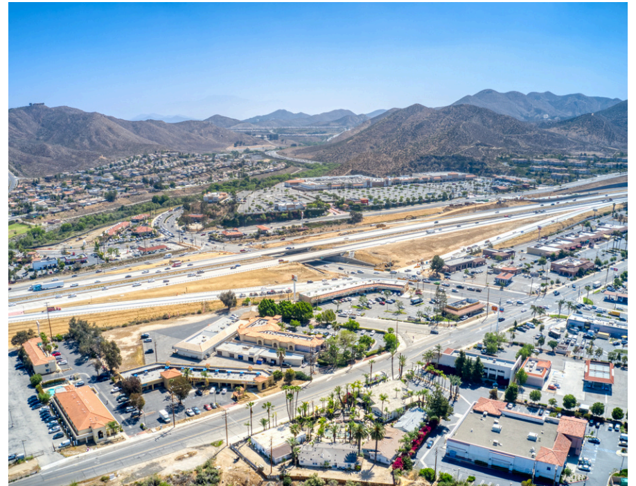
Aerial View to East