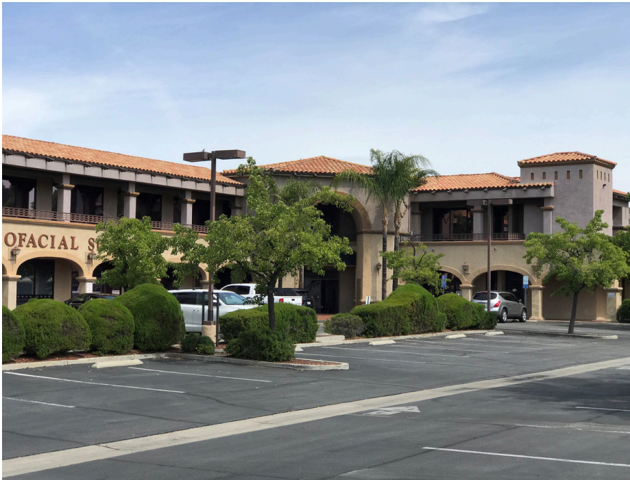
Private, Fenced Parking Lot