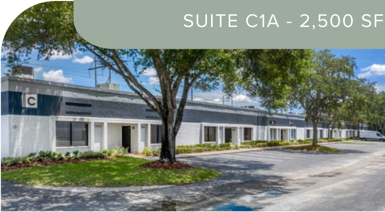
SUITE C1A - 2,500 SF

12900 DUPONT CIRCLE, SUITE C1A | TAMPA, FL 33626