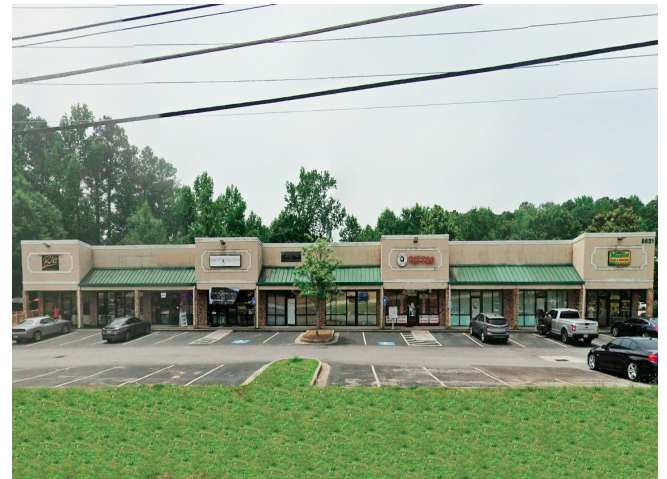
Brookwood Village Shopping Center 8331 Hwy 42 - Rex, Georgia 30273