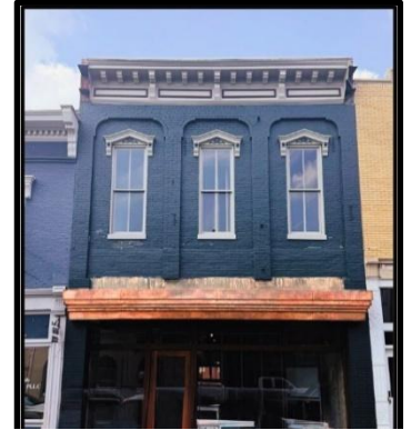
FIGURE 1: 541 Main Street