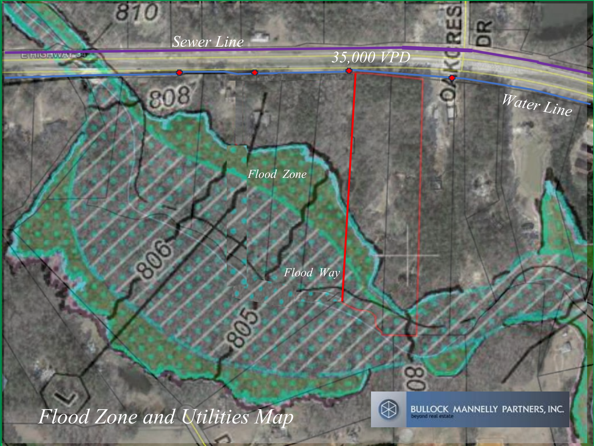
Flood Zone and Utilities Map