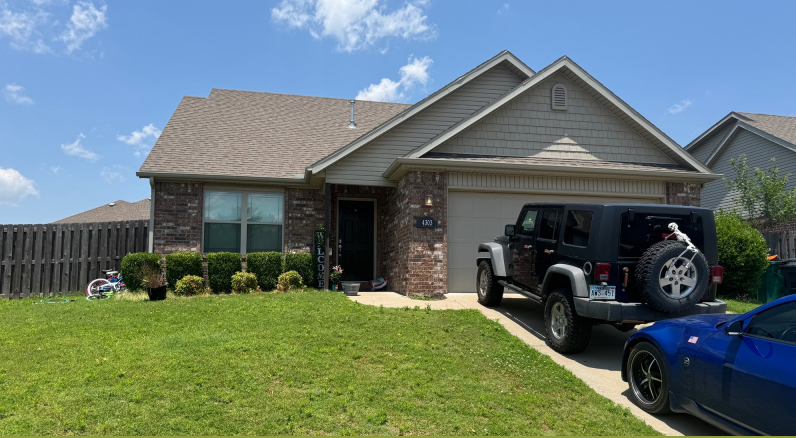
4303 Langmead Dr: 1,430