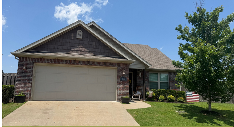
4301 Langmead Dr: 1,430