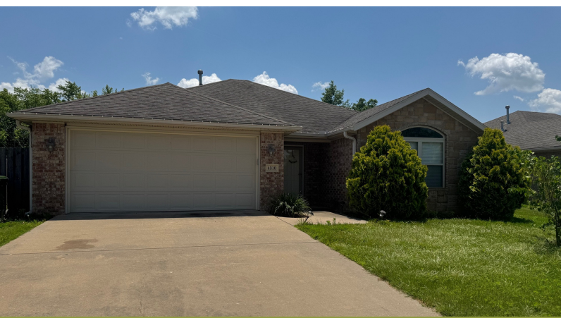
4310 Langmead Dr: 1,445