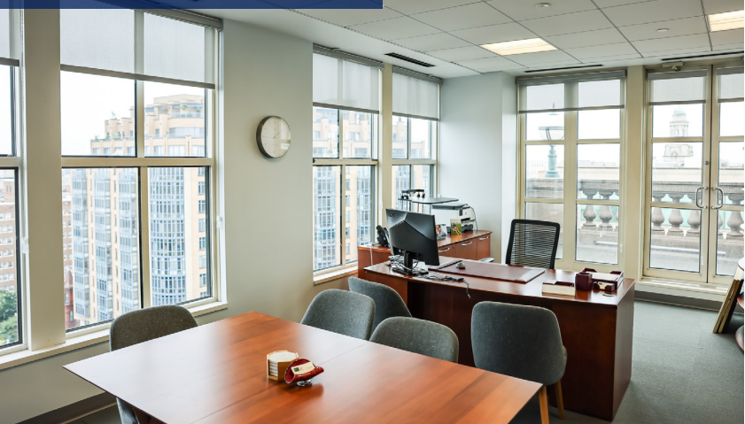
EXECUTIVE CORNER OFFICE