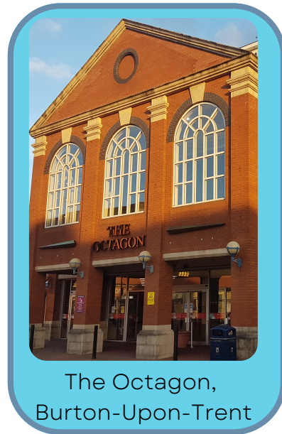
The Octagon, Burton-Upon-Trent