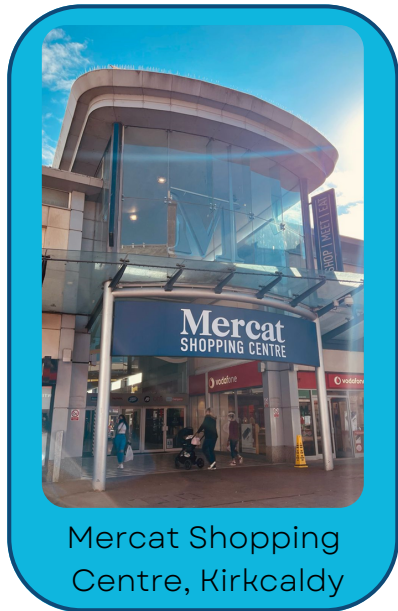
Mercat Shopping Centre, Kirkcaldy