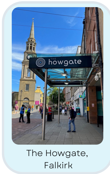
The Howgate, Falkirk