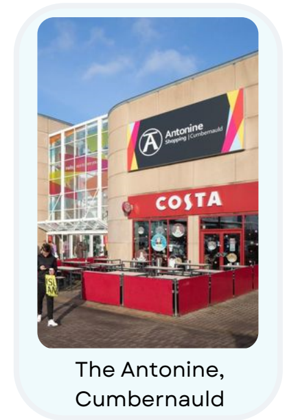
The Antonine, Cumbernauld