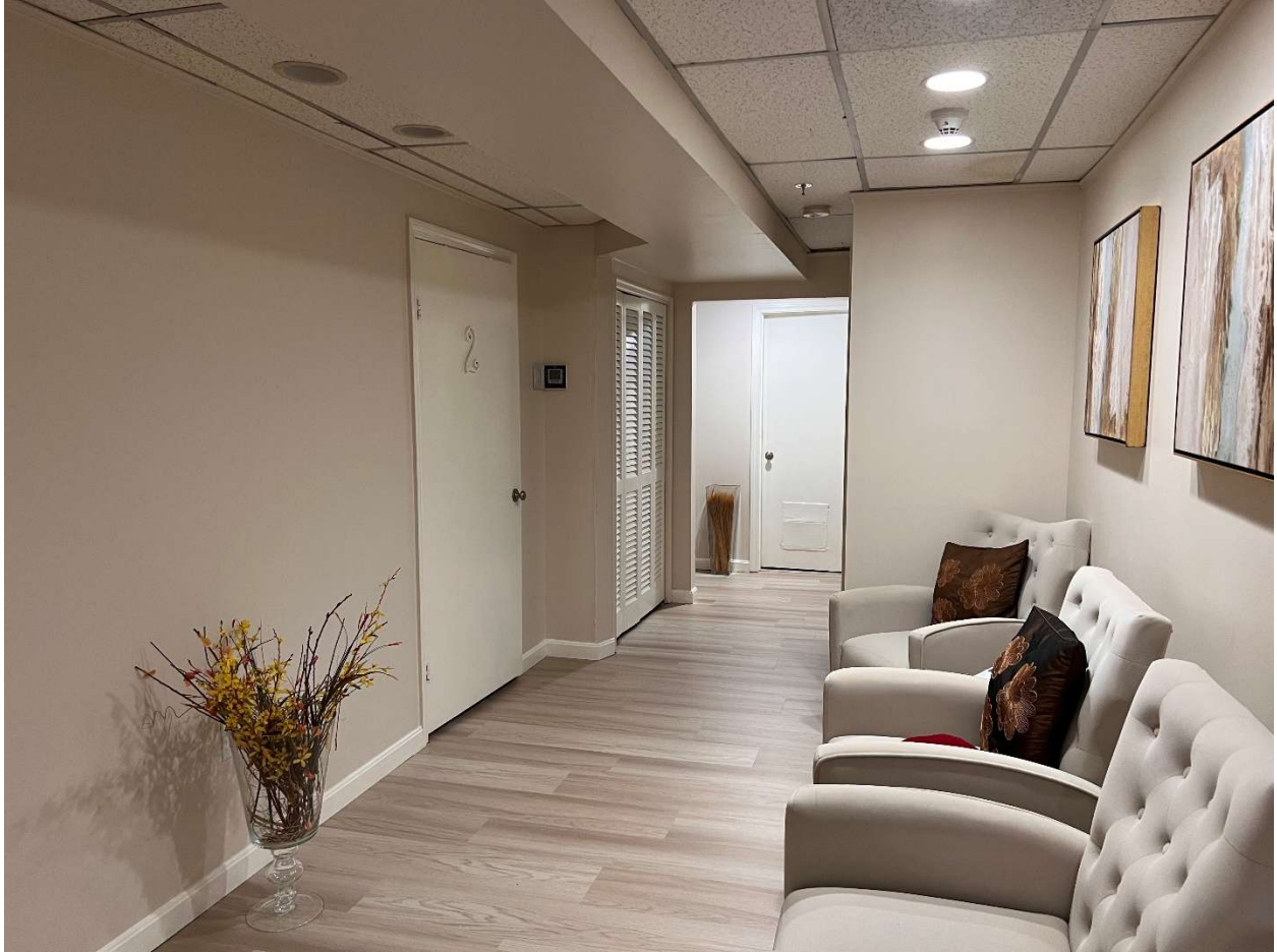
Lower level massage waiting area