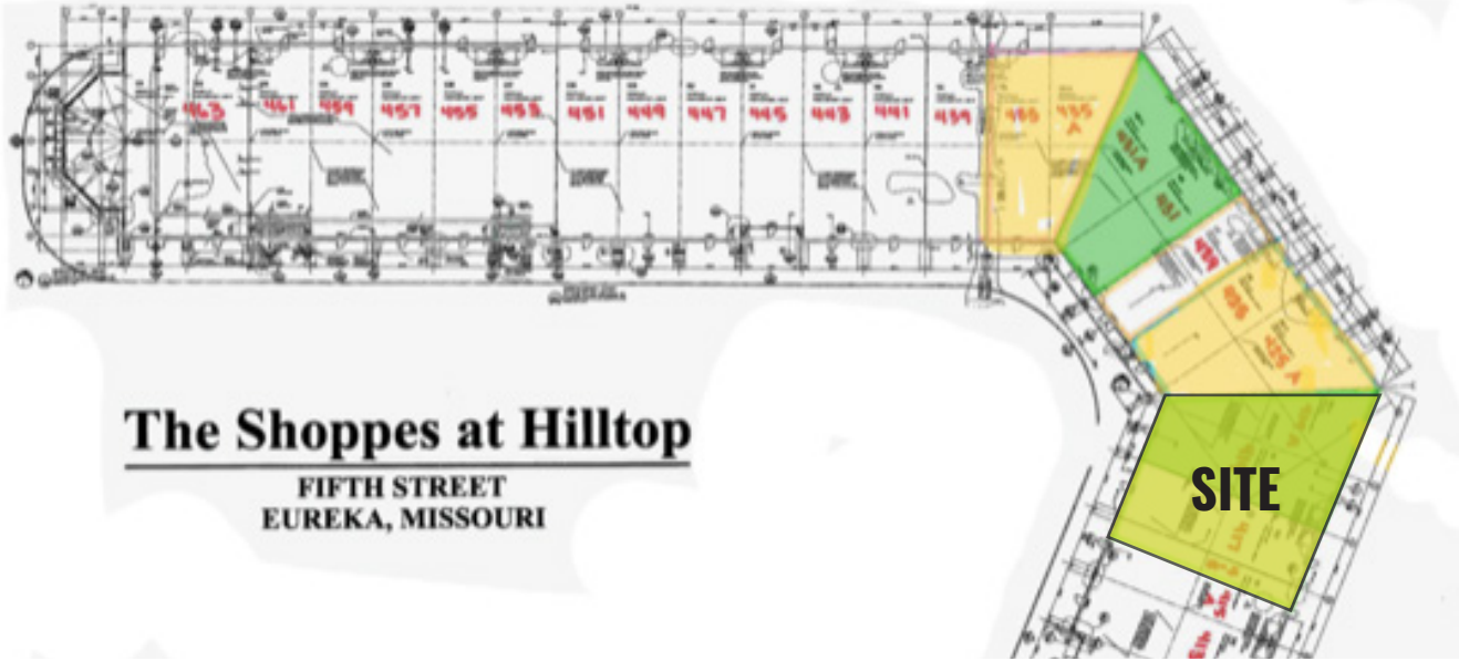
The Shoppes at Hilltop FIFTH STREET EUREKA, MISSOURI