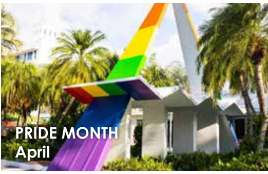
PRIDE MONTH April