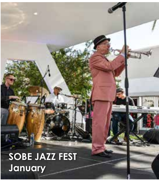
SOBE JAZZ FEST January