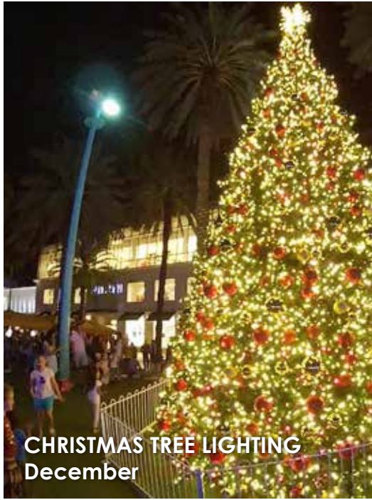
CHRISTMAS TREE LIGHTING December