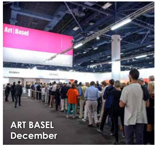
ART BASEL December