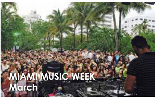
MIAMI MUSIC WEEK March