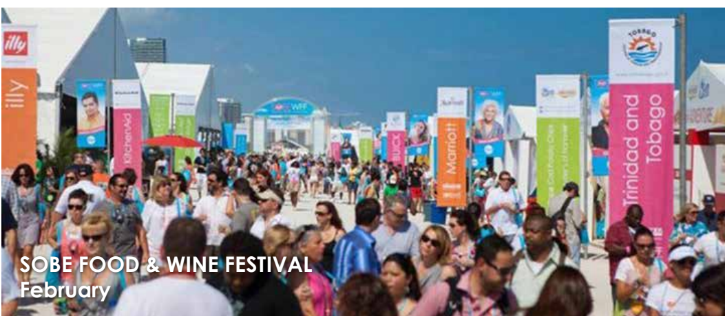
SOBE FOOD & WINE FESTIVAL February