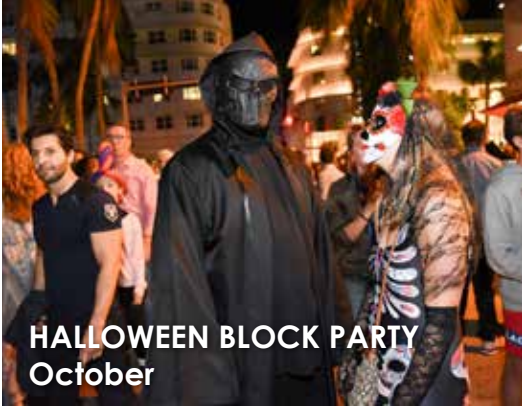
HALLOWEEN BLOCK PARTY October