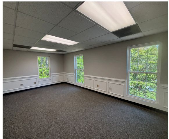
GREENVILLE COUNTY TAX MAP NO 0533240100200