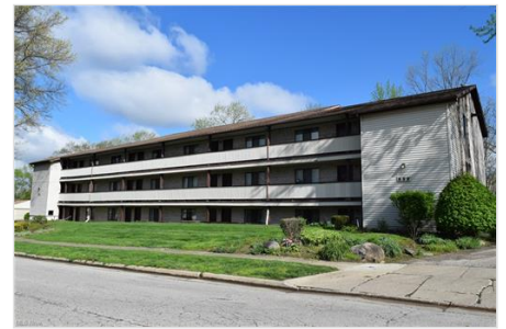
Front of Structure

Information is Believed To Be Accurate But Not Guaranteed