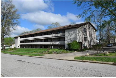
Front of Structure

Apartment SqFt: 0 Bsmt: Yr: 1978 Acres: 0.78 $1,380,000