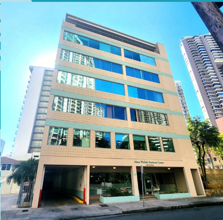
460 ENA ROAD

Alana Waikiki Business Center at 460 Ena Road is a seven-story office and retail building strategically positioned in the heart of the Waikiki business and tourism district on Oahu. The property sits adjacent to DoubleTree by Hilton Alana Waikiki Beach, providing immediate access to one of Hawaii's most iconic travel hubs and benefiting from strong visitor and local foot traffic. The building offers flexible office and retail space with amenities such as 24-hour air conditioning, on-site valet parking, and meeting room access, making it attractive to a wide range of professional and service-oriented tenants in addition to retail users.