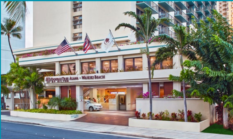
DoubleTree Hotel by Hilton Alana

Conference and meeting rooms encompassing an entire floor are available to tenants at no cost and may be used for events, gatherings, and seminars.