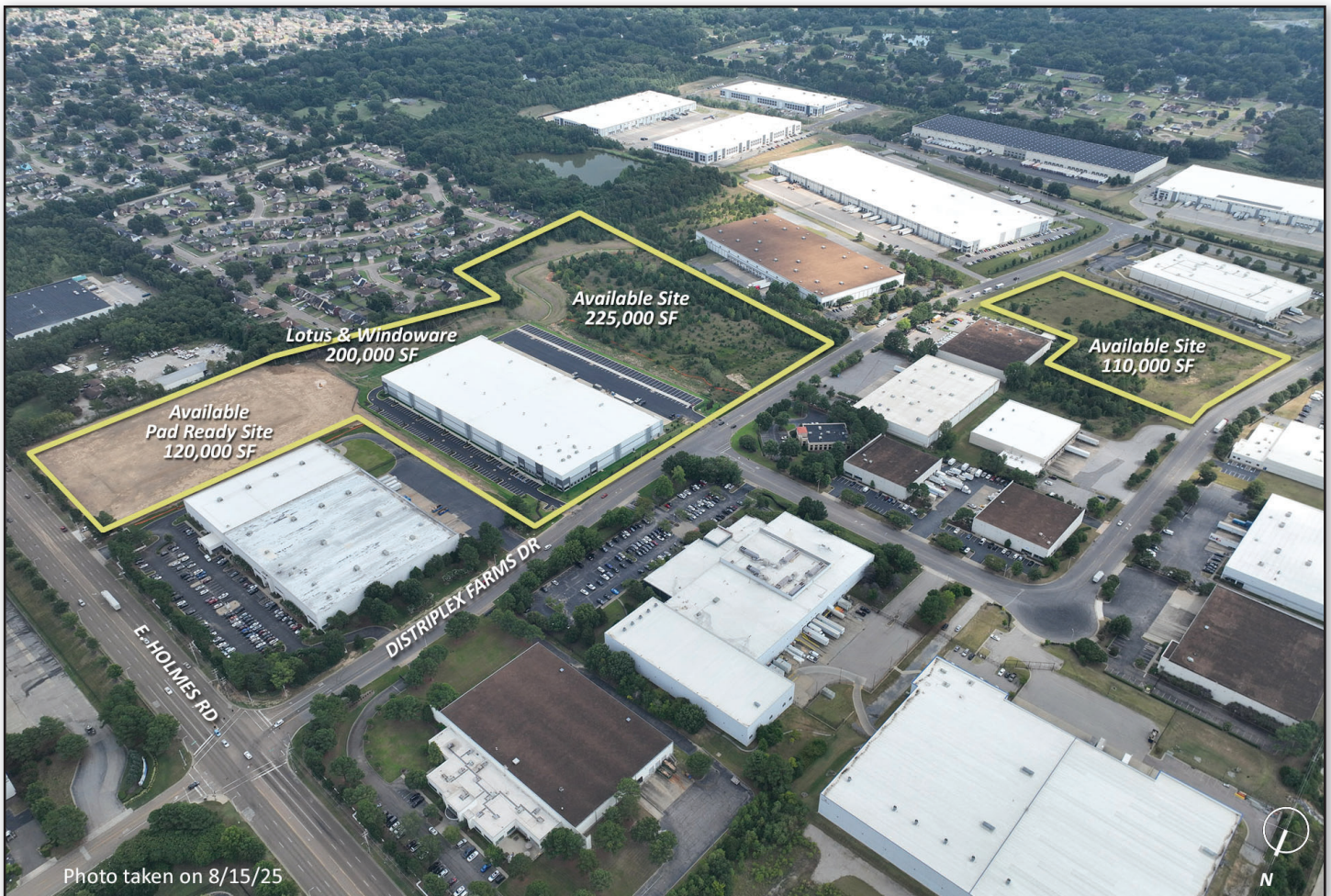
Photo taken on 8/15/25