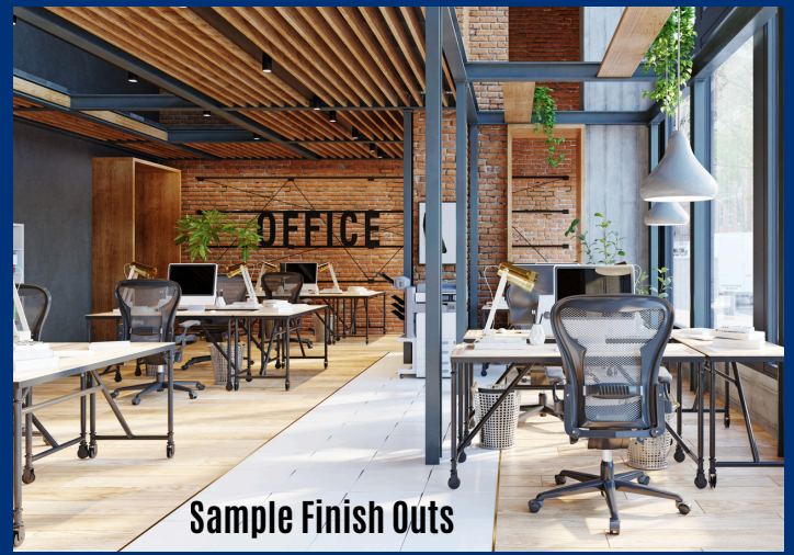
Sample Finish Outs