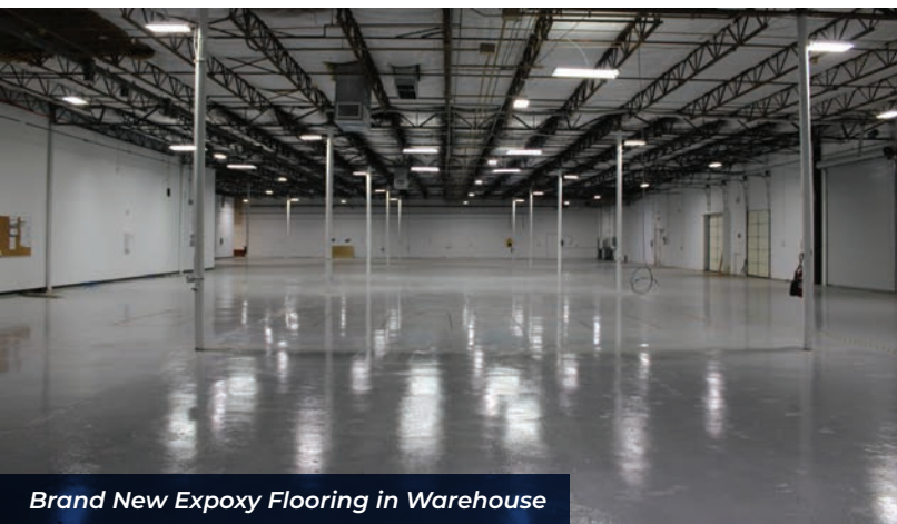
Brand New Epoxy Flooring in Warehouse