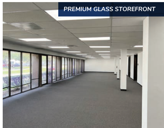
PREMIUM GLASS STOREFRONT