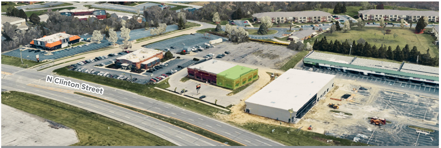
Imagery from the dates: 7/23/2015-8/18/2025 Landsat / Copernicus NOAA Data SIO, NOAA, U.S. Navy, NGA, GEBCO Airbus

4810 North Clinton Street Fort Wayne, IN 46825