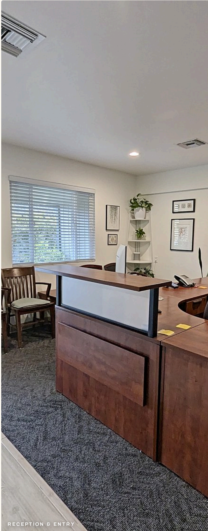
RECEPTION & ENTRY