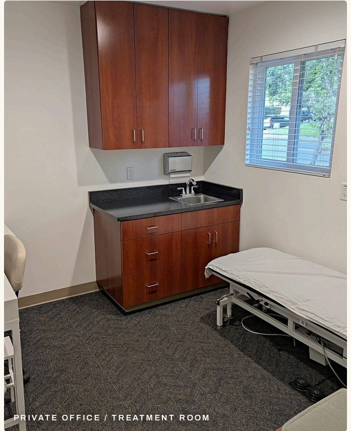
PRIVATE OFFICE / TREATMENT ROOM