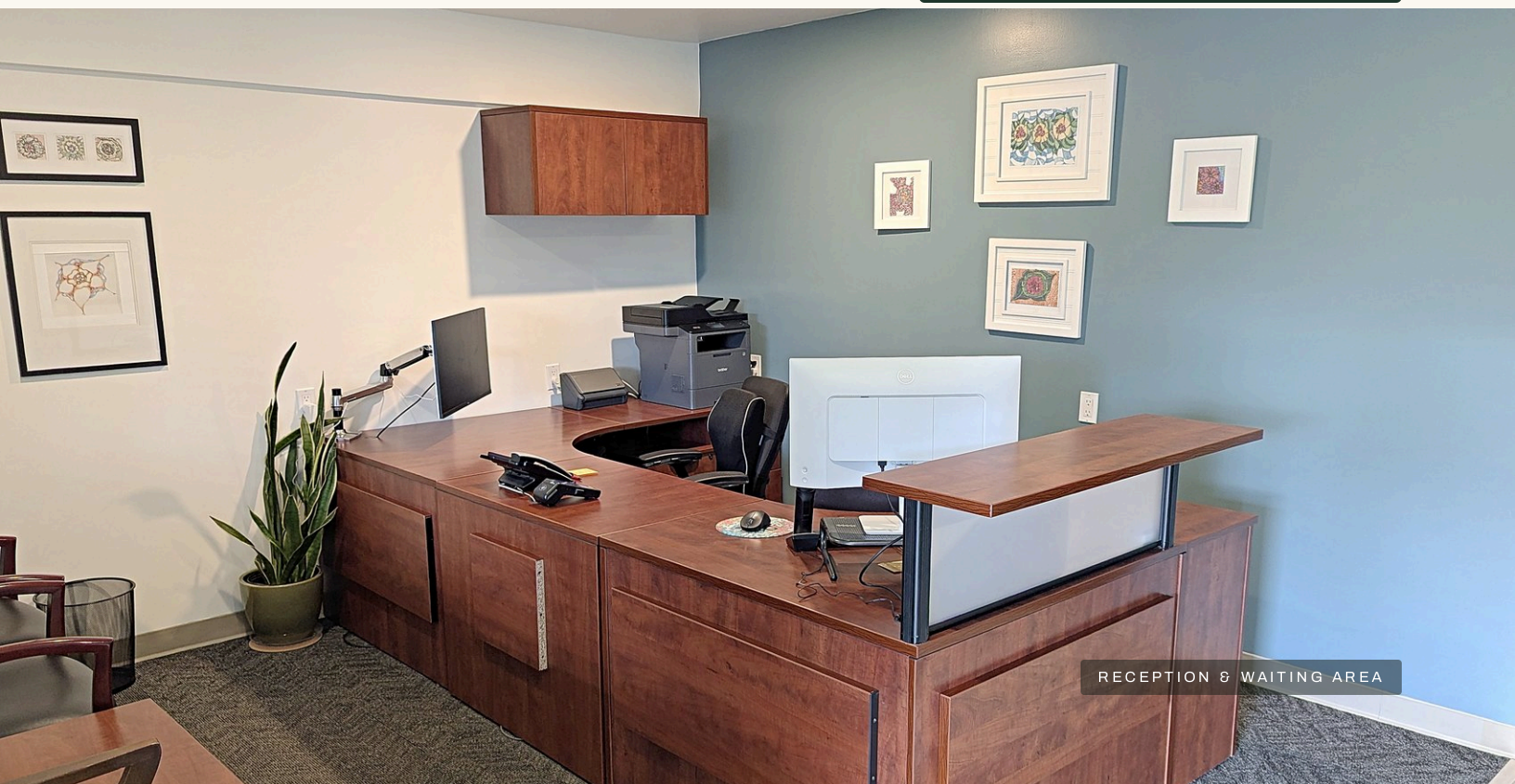
RECEPTION & WAITING AREA