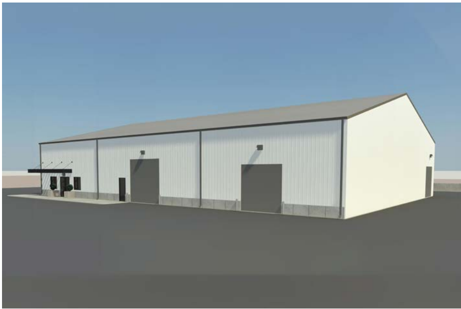
SOUTH EAST VIEW