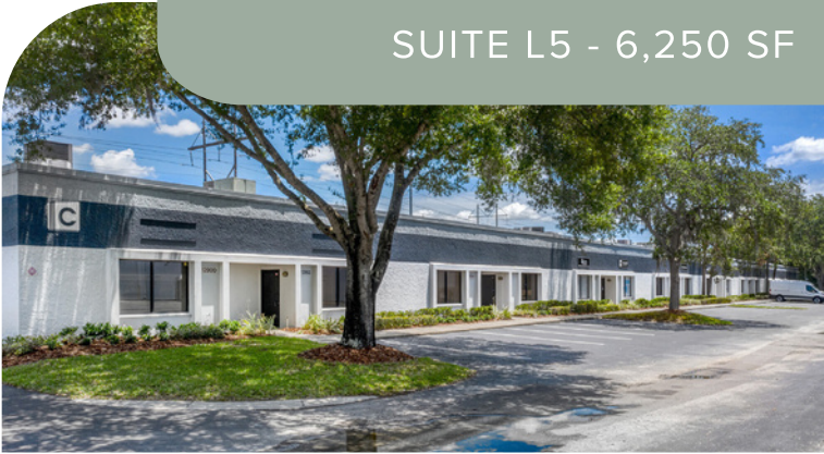
SUITE L5 - 6,250 SF

14150 MCCORMICK DRIVE, SUITE L5 | TAMPA, FL 33626