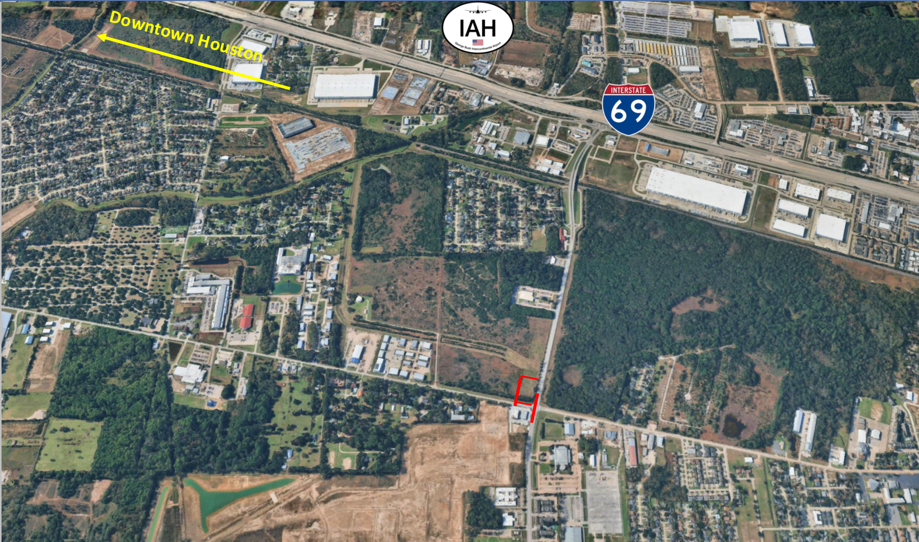
Prime Commercial Corner Serving Houston's Fastest-Growing Corridor