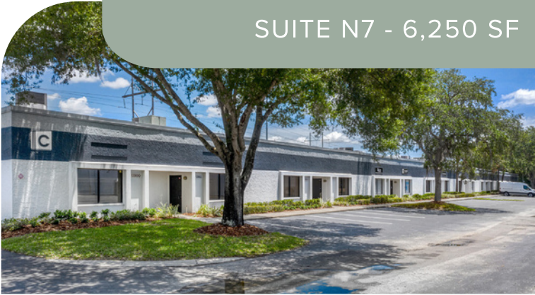
SUITE N7 - 6,250 SF

14470 CARLSON CIRCLE, SUITE N7 | TAMPA, FL 33626