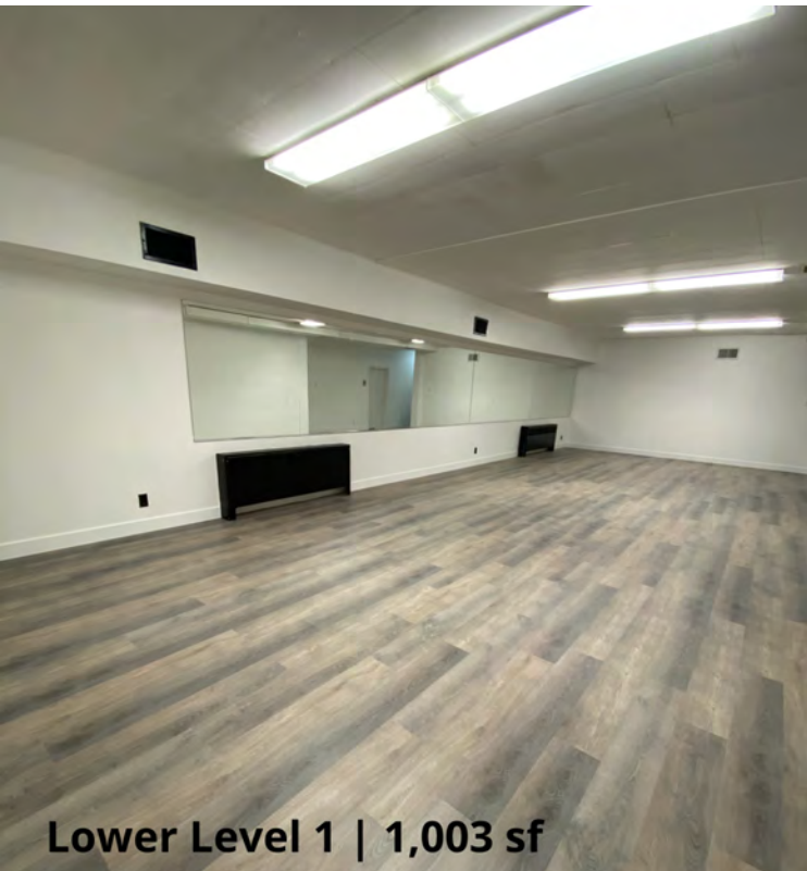
Lower Level 1 | 1,003 sf