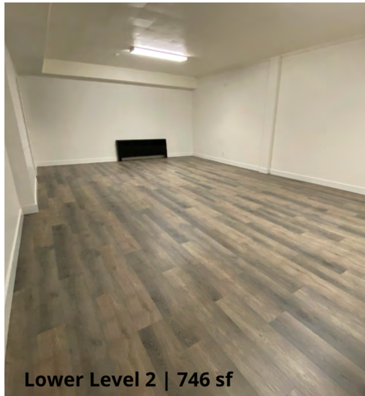
Lower Level 2 | 746 sf