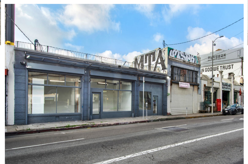
236 W. 18TH STREET, LOS ANGELES, CA