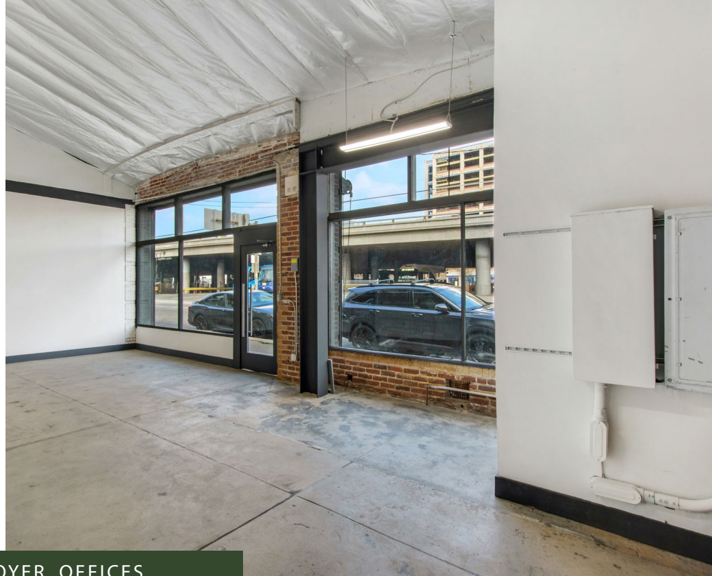
GLASSED-IN FOYER, OFFICES + PRIVATE RESTROOMS