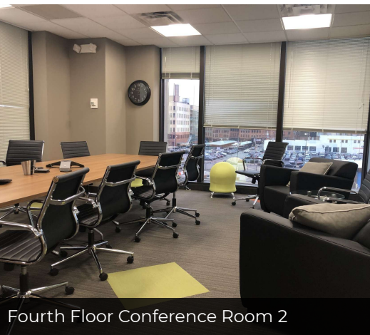
Fourth Floor Conference Room 2