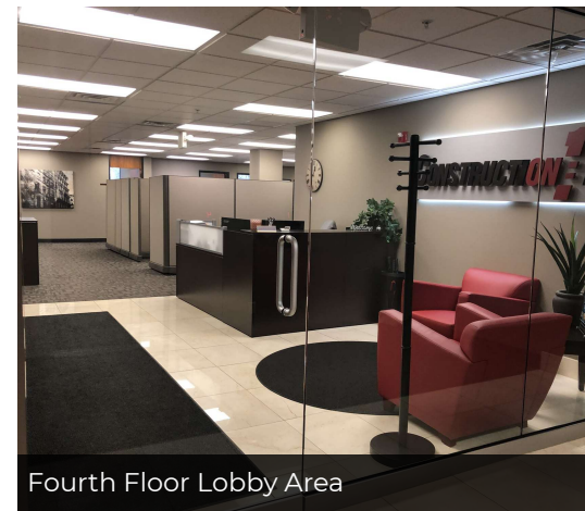
Fourth Floor Lobby Area