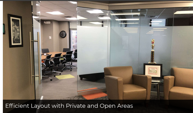
Efficient Layout with Private and Open Areas