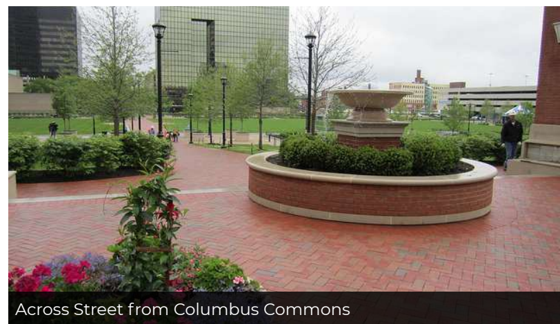
Across Street from Columbus Commons