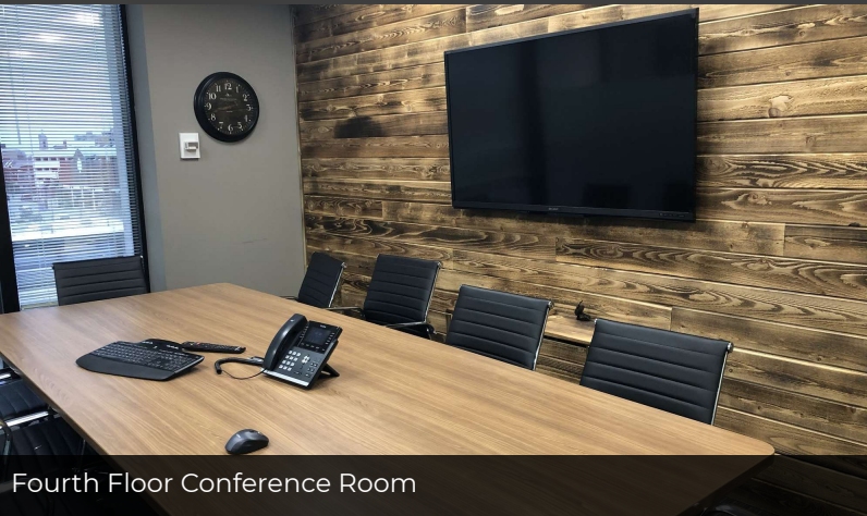
Fourth Floor Conference Room

101 EAST TOWN STREET, 4TH FLOOR, COLUMBUS, OH 43215