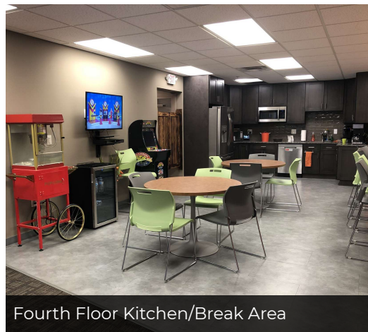
Fourth Floor Kitchen/Break Area