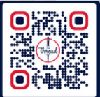
The Thread Video