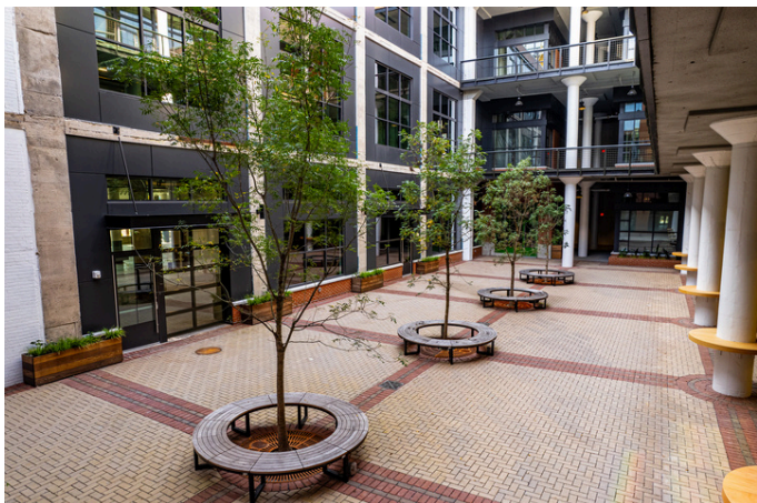
THE THREAD | ROCK HILL, SC