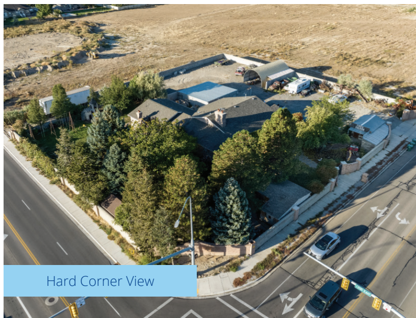
Hard Corner View