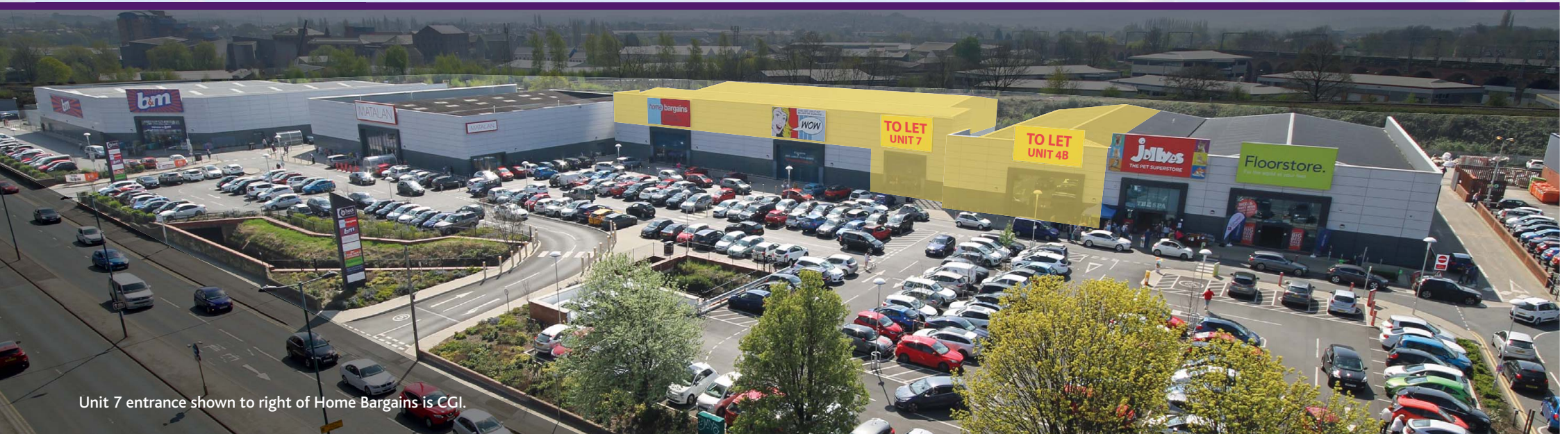
Unit 7 entrance shown to right of Home Bargains is CGI.