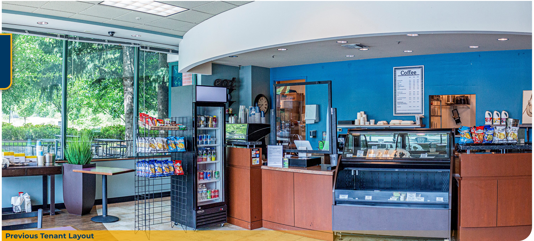
Previous Tenant Layout