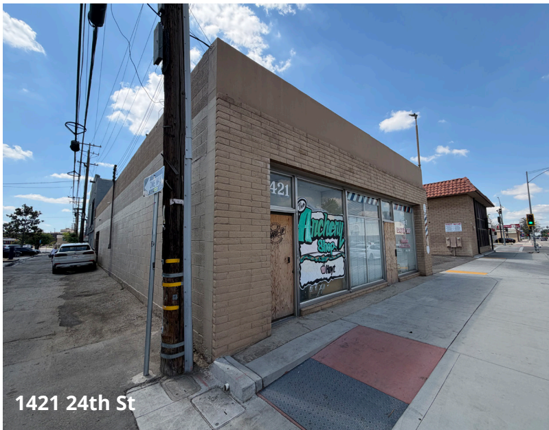
1421 24th St