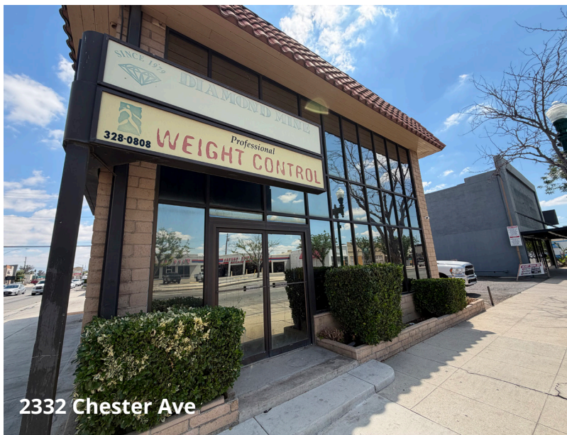
2332 Chester Ave