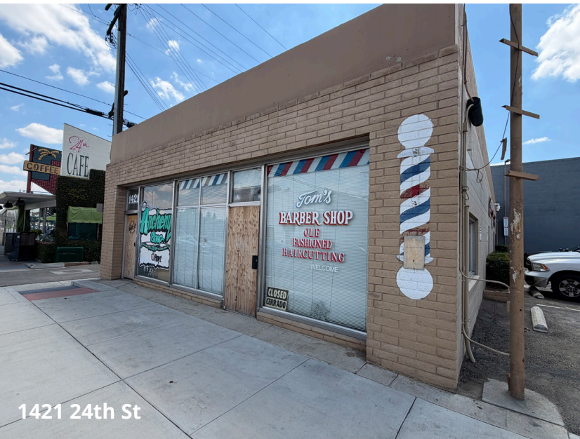
1421 24th St