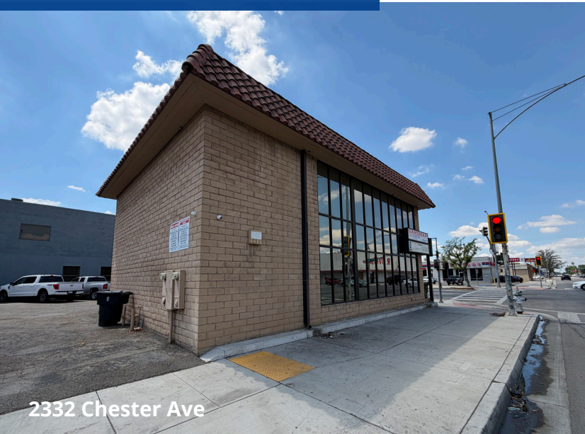
2332 Chester Ave