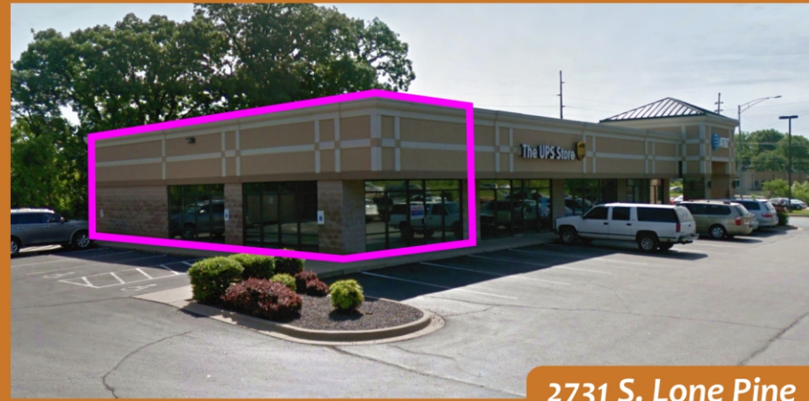
2731 S. Lone Pine