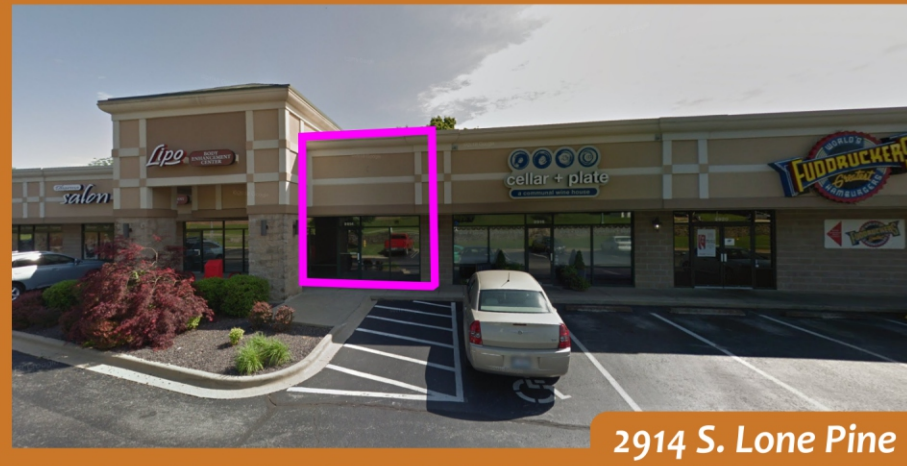
2914 S. Lone Pine