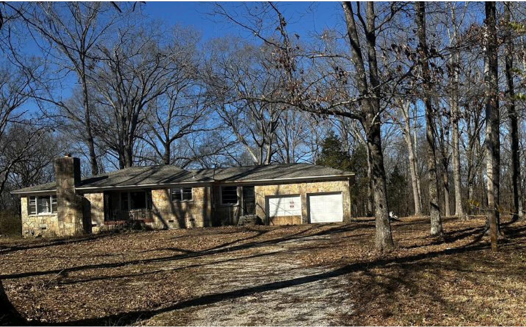
1475 US-64, Hickory Withe, TN 38028