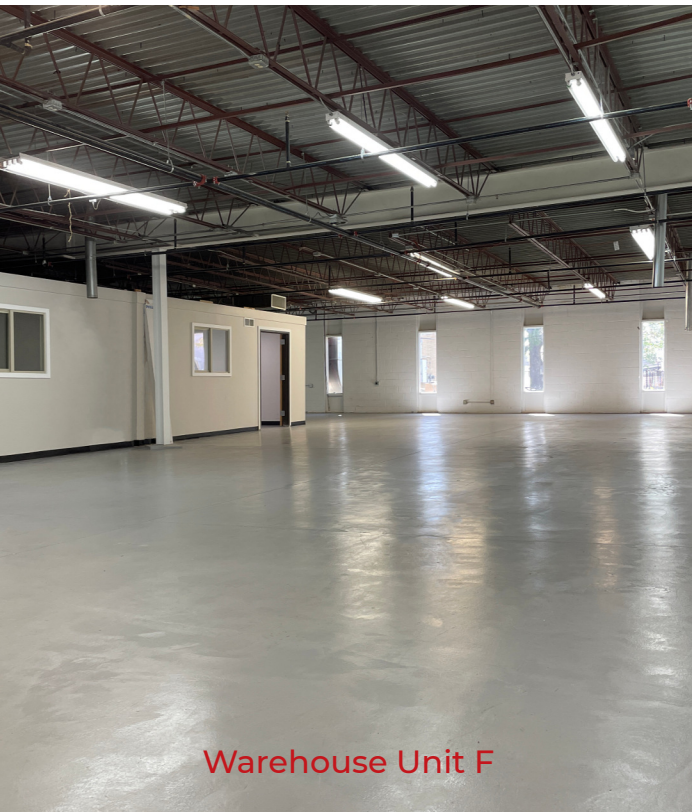
Warehouse Unit F