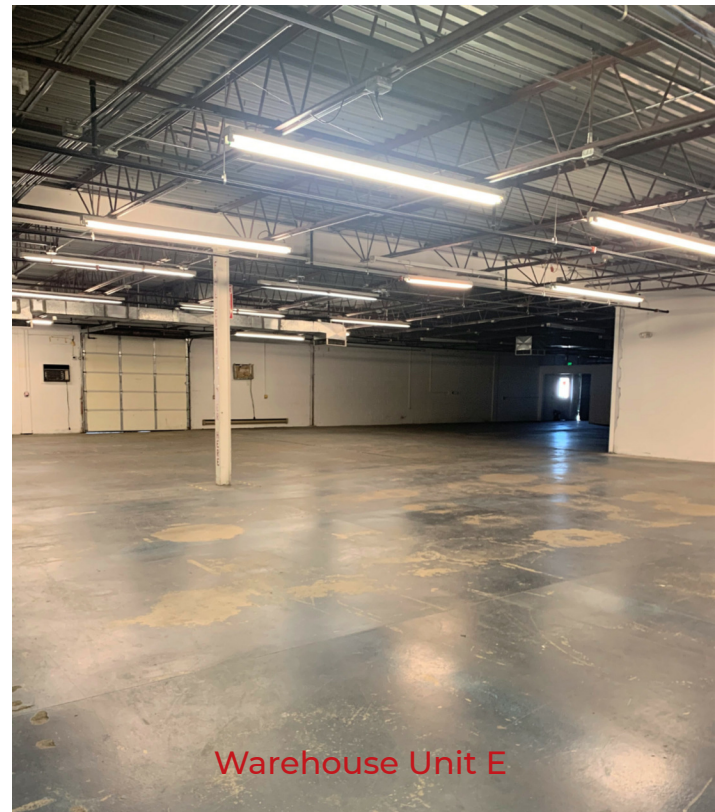
Warehouse Unit E