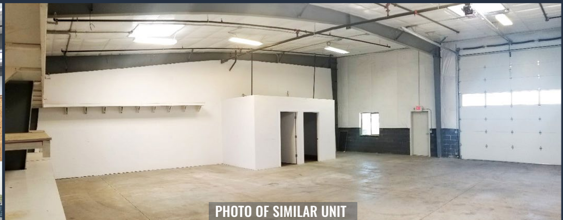
PHOTO OF SIMILAR UNIT