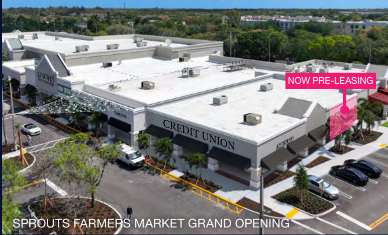
SPROUTS FARMERS MARKET GRAND OPENING