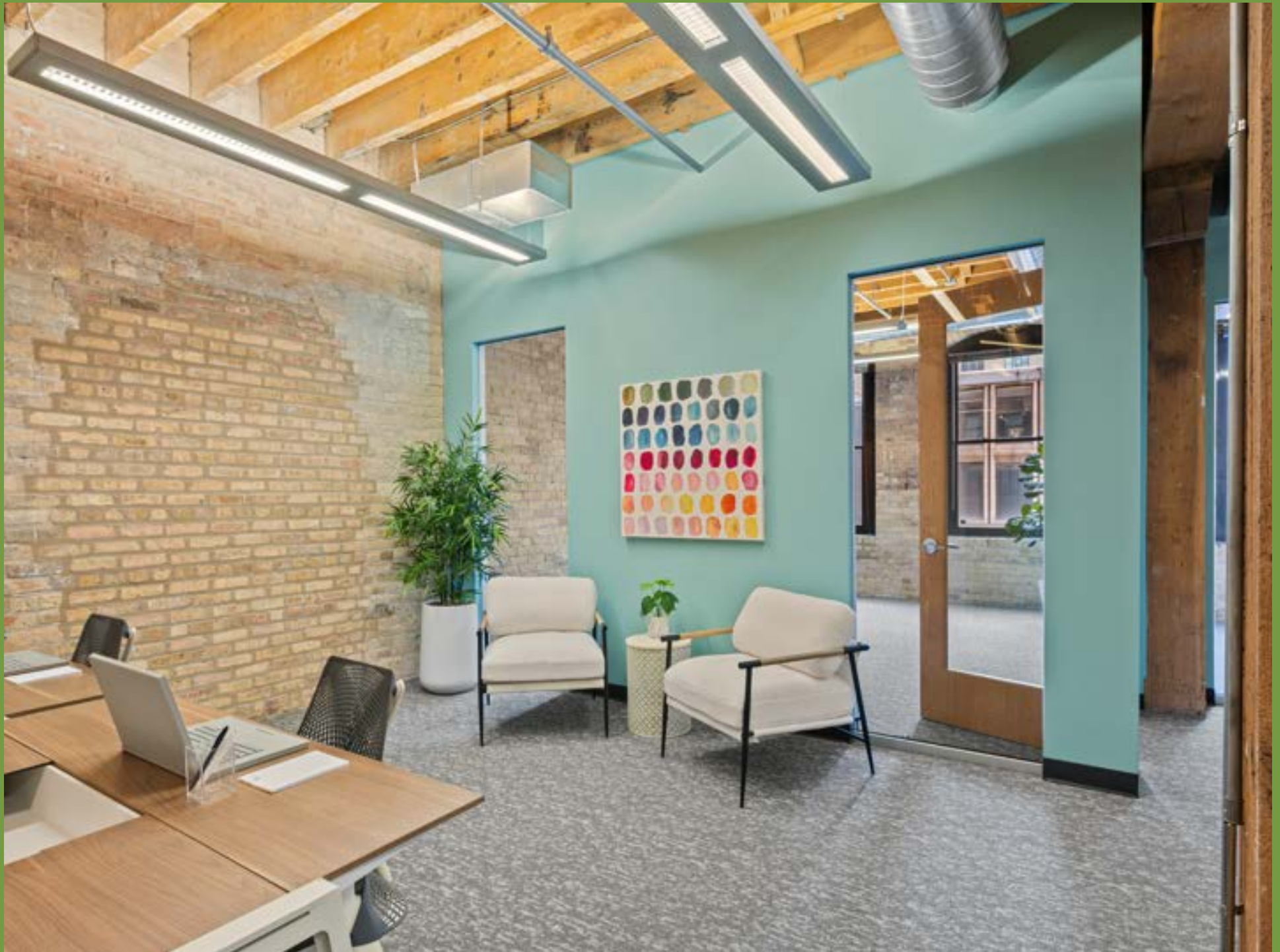
Photos taken from a similar space in the building