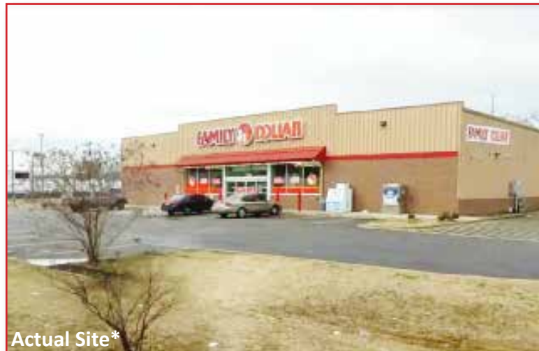
*This location is no longer an operating Family Dollar.