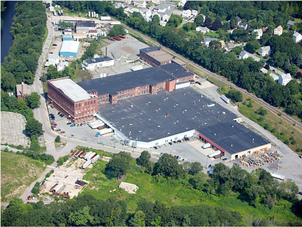
Aerial Front View