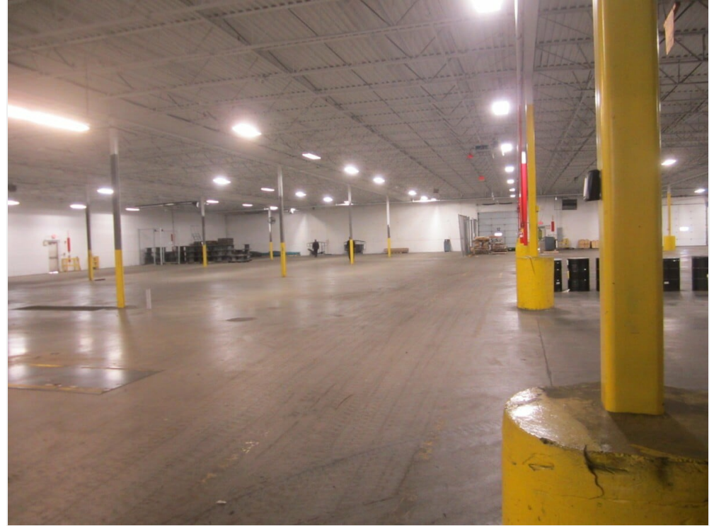
33,000 SF Industrial For Lease