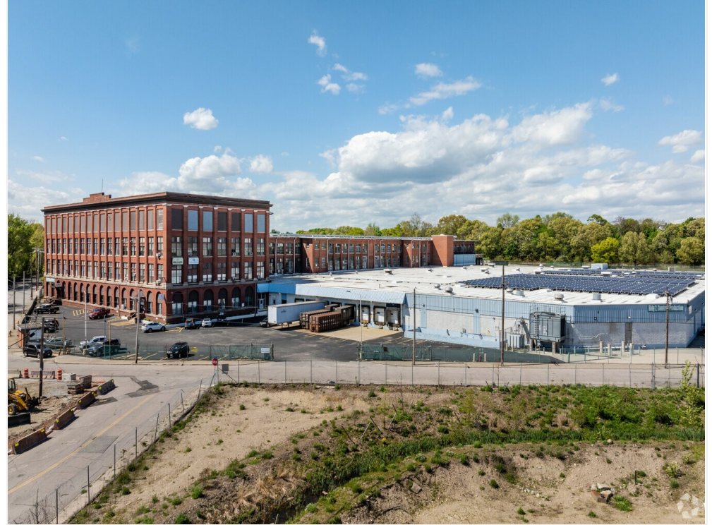
Aerial Front View