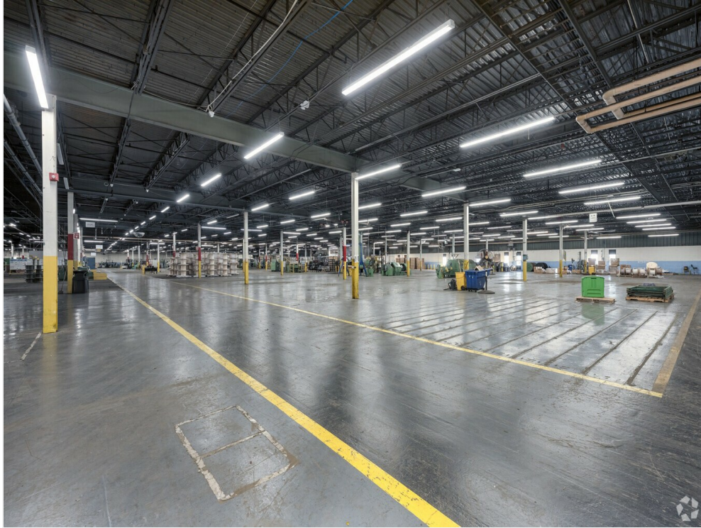
Industrial Space For Lease