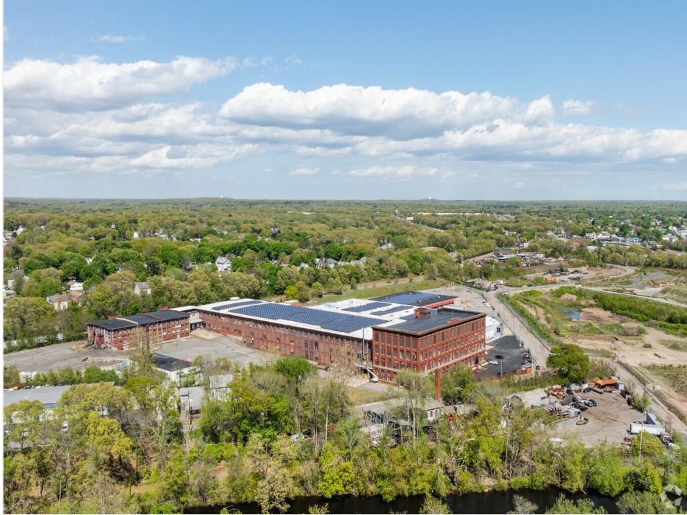
Aerial Rear View