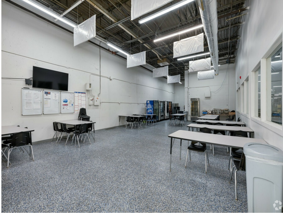
Conference Room/Break Room