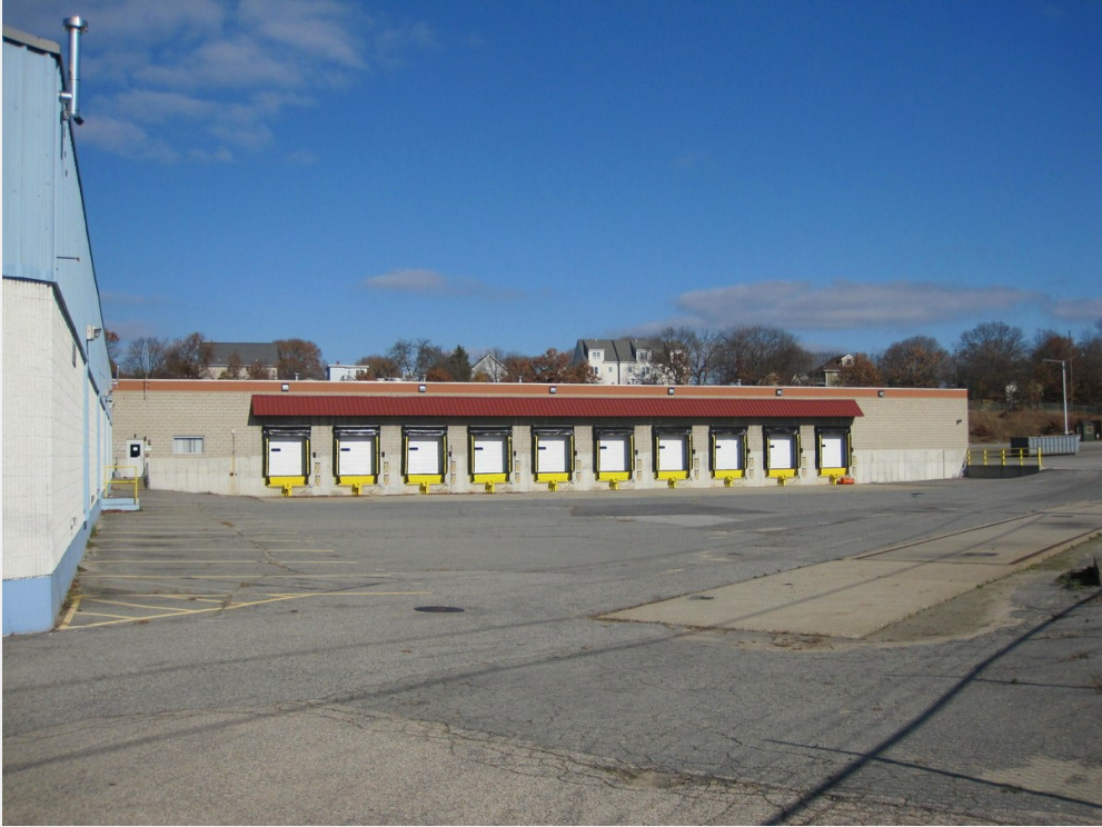
Loading Docks of 33,000 SF Section For Lease