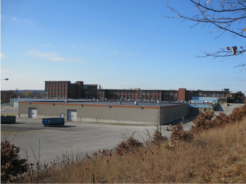
Building Side View