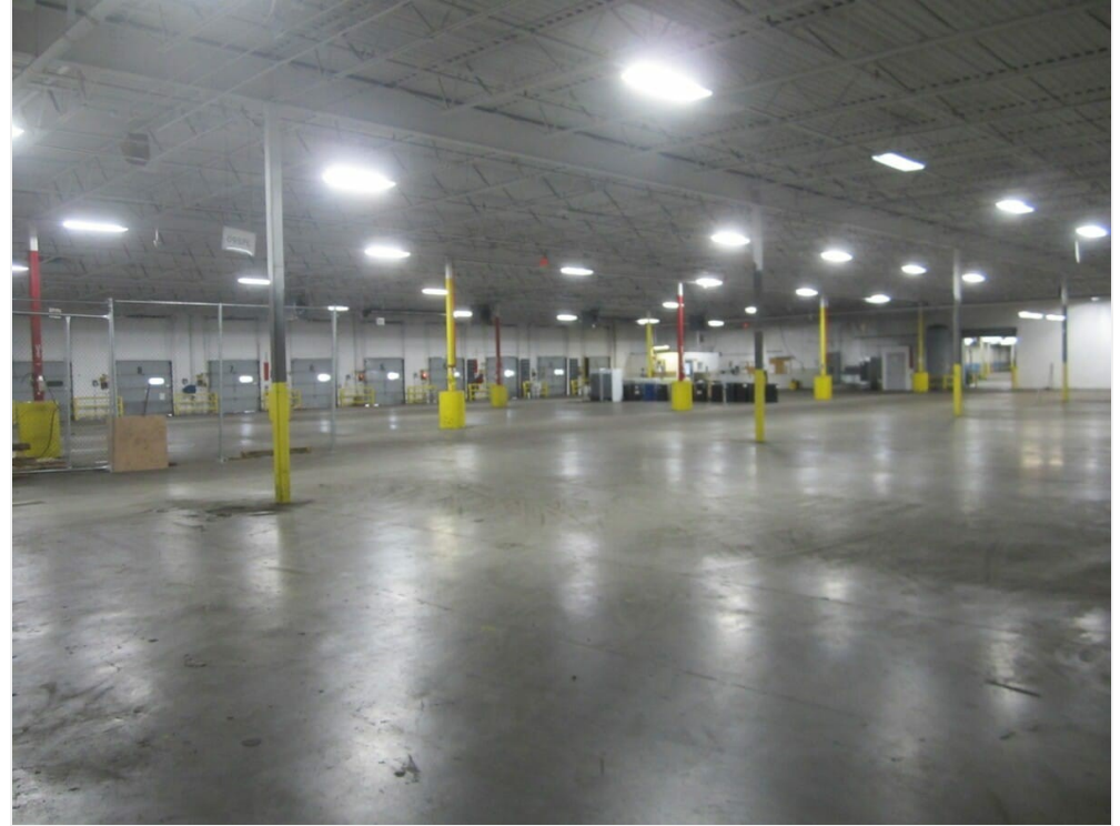
Industrial Space For Lease