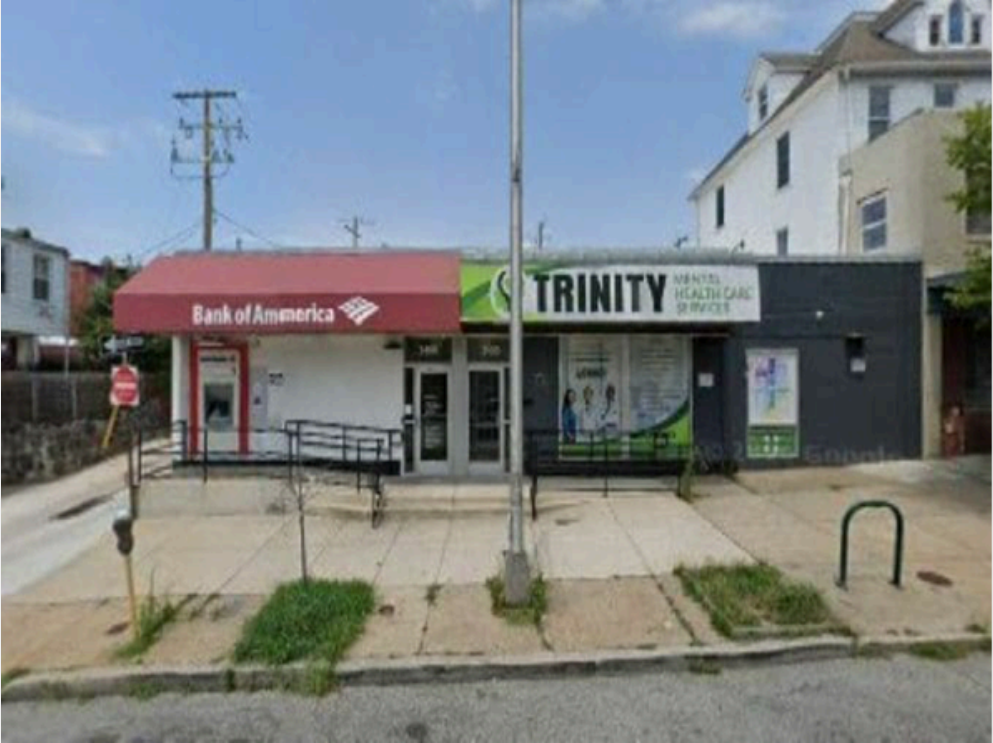
Exterior of Building