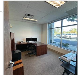
Not to scale. Not as built.

DISCLAIMER: The information contained herein has been obtained from the property owner or other third party and is provided to you without verification as to accuracy. We (Tidemark Real Estate Services, Inc., its brokers, employees, agents, principals, officers, directors and affiliates) make no warranty or representation regarding the information, property, or transaction. You and your attorneys, advisors and consultants should conduct your own investigation of the property and transaction.