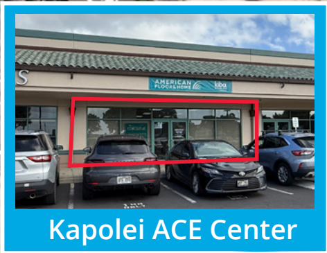
Kapolei ACE Center