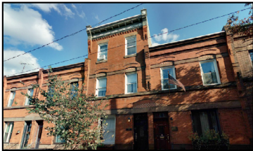
Table 14-701-1: Dimensional Standards for Lower Density Residential Districts