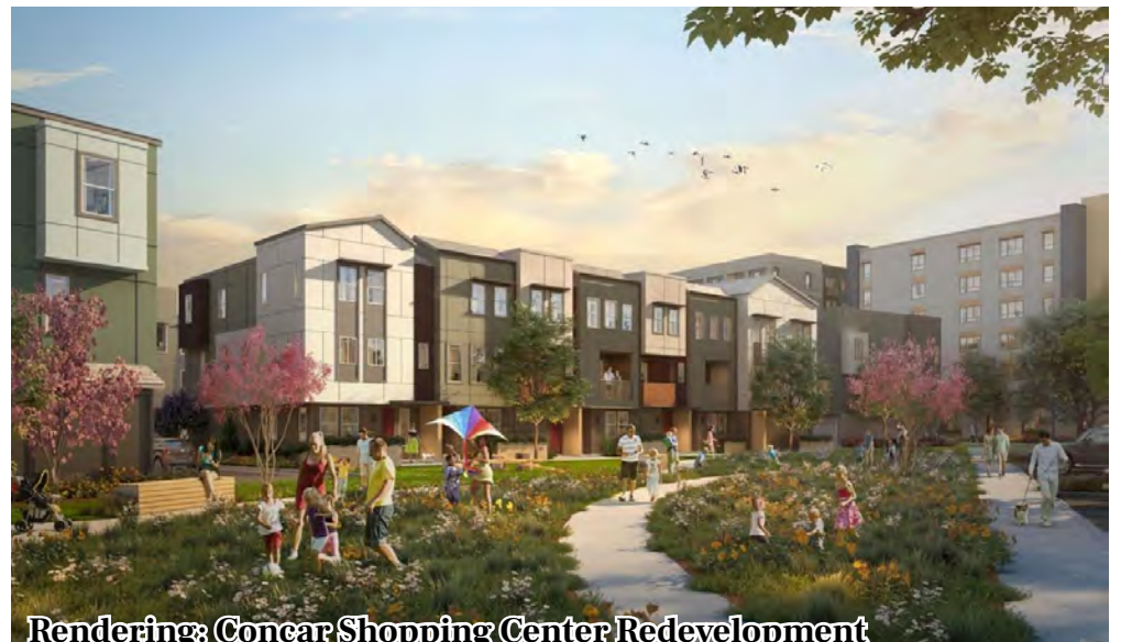
Rendering: Concar Shopping Center Redevelopment

Brookfield Properties has proposed a major redevelopment of the Concar Shopping Center located on Concar Drive between Grant Street and Delaware Street. The developer proposes to replace most of the existing 14.5-acre retail center except for Trader Joe's with a new residential-focused community. The plan, filed under SB 330 in early 2025 and formally submitted that August, includes 847 residences comprised of 139 townhomes in three-story buildings and 708 apartments in six- to seven-story buildings. Of these residential units, 22 percent (186 units) would be affordable for low and very low income households. The commercial component is limited to about 3,100 square feet of new space, largely accommodating a 7-Eleven, as well as preserving the existing space occupied by Trader Joe's. Overall, the redevelopment reflects a housing forward vision that emphasizes density, affordability, and neighborhood services in a prime location.