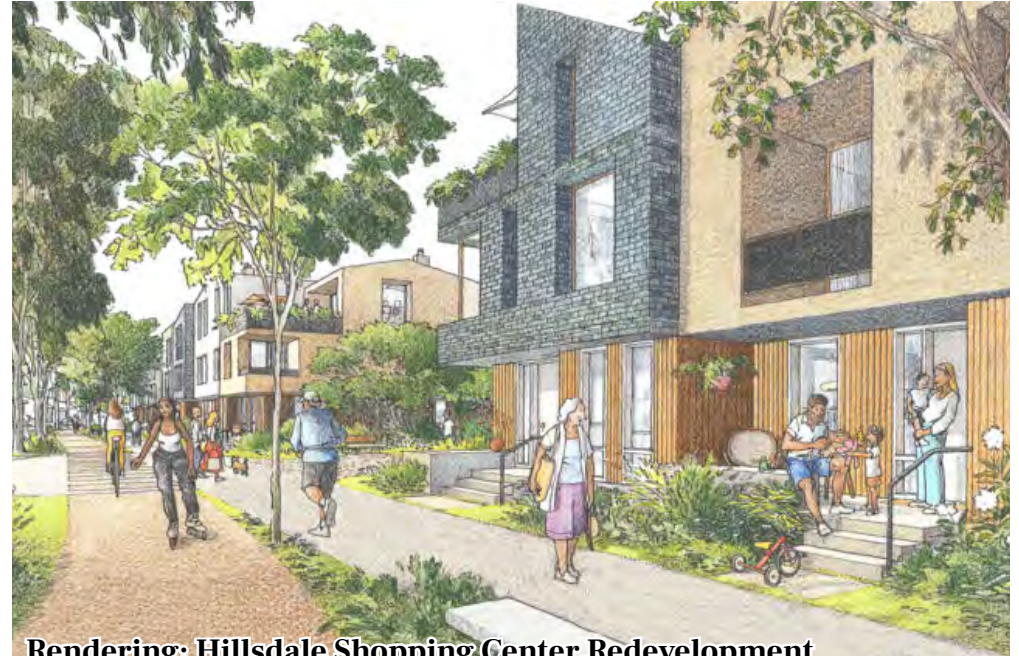
Rendering: Hillsdale Shopping Center Redevelopment

Redevelopment of the Hillsdale Shopping Center in San Mateo will transform nearly 45 acres of this indoor mall into a large-scale mixed-use district. While the newer North Block of outdoor retail would remain, nearly 1.5 million square feet of space in the older mall would be demolished to make way for the new project. Current plans include up to 1,670 multifamily residences, including 14% affordable units, along with 2.06 million square feet of new commercial uses. Building heights would range from eight to ten stories along El Camino Real and step down to three story townhomes near the Beresford neighborhood. Bohannon Development and Northwood Investors are partnering with Sares Regis Group to redevelop the site. The project emphasizes walkability, plazas, and greenways just half a mile from Caltrain, supported by structured parking and transportation demand management programs. A preliminary application was filed under SB 330 in February 2025, followed by a formal application in June, securing eligibility for streamlined review. A City Council study session is scheduled for November 2025, with CEQA studies anticipated into 2026 and hearings likely that fall.